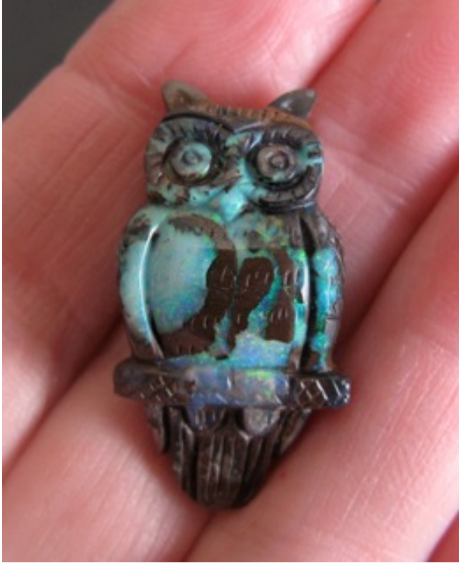
32. $195 IMG_0516 Boulder Owl with attitude, lovely blues, greens & reds 37.9cts