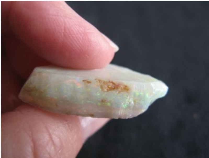
13. $840 IMG_0860 Mintubi $4,000/oz approximately 25mm x 25mm at widest point .21oz