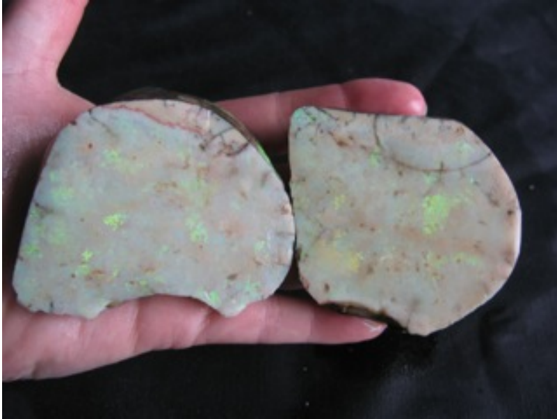
14. $845 IMG_0951 Andamooka Matrix 12.2oz