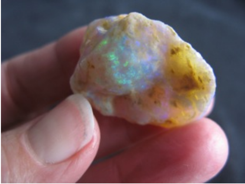
18. $900 IMG_0789 Shell Super Gem double sided 48.15cts