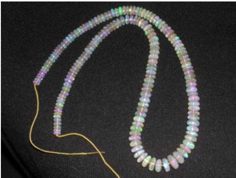
29. $1,500 DSCN3647 Andamooka 5-9mm rondel 96cts