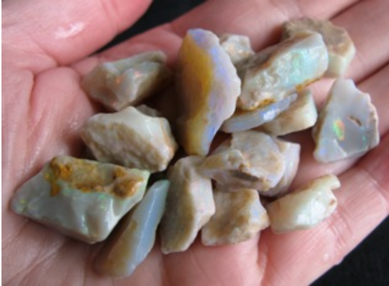
2. $72 IMG_0944 Dead Horse Gully Dark Base $60/oz 1.2oz