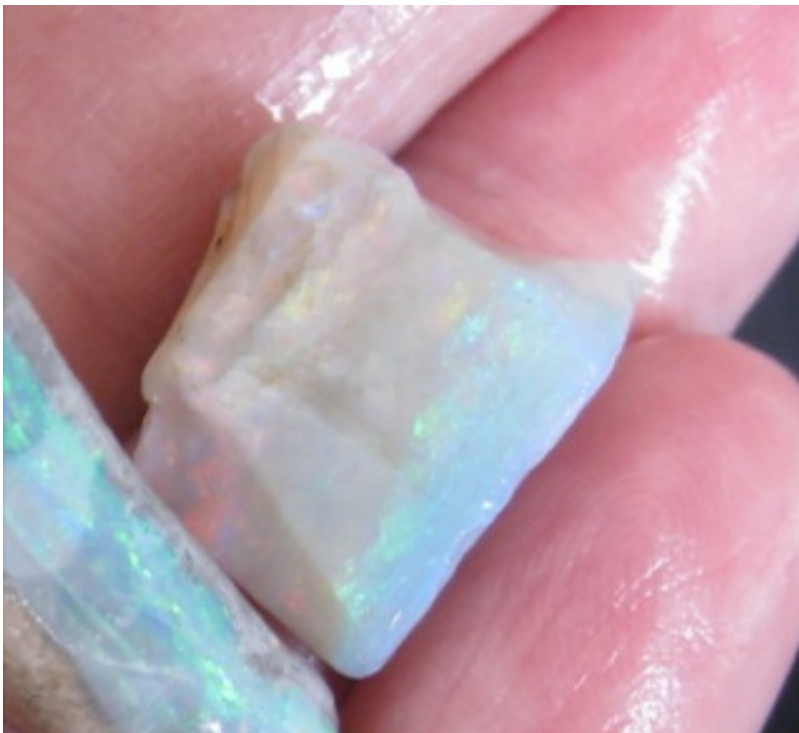
21. $946 IMG_0215 Mixed Gems $2,200/oz .43oz