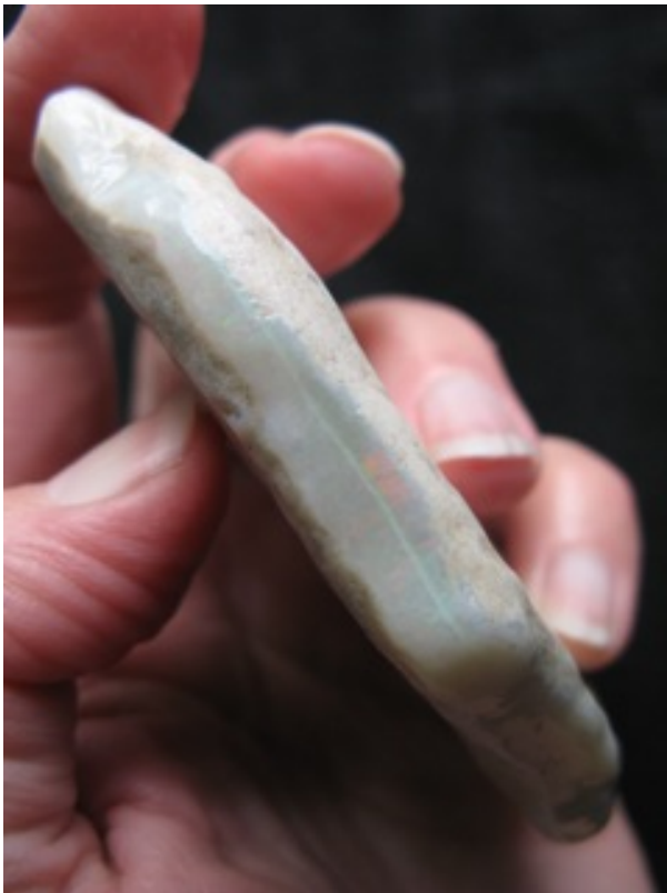
3. $96 IMG_0950 Mintubi on Sandstone $40/oz .375" x 3.25" x 2" thick 2.4oz