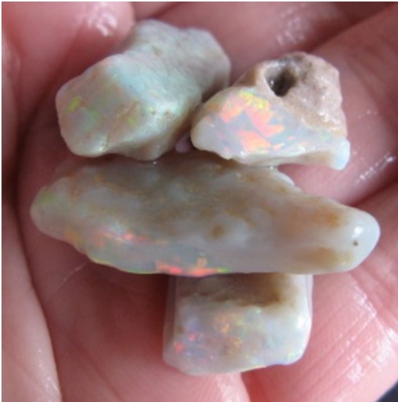
5. $174 IMG_0932 Dead Horse Gully Dark Base $600/oz .29oz