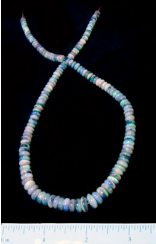
28. $1,495 MsbrnBak1 Mintubi Semi Black 5-10mm rondel 114cts