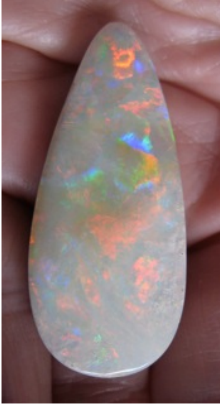
4. $115 IMG_0943 Mintubi on Sandstone faced 34.2cts