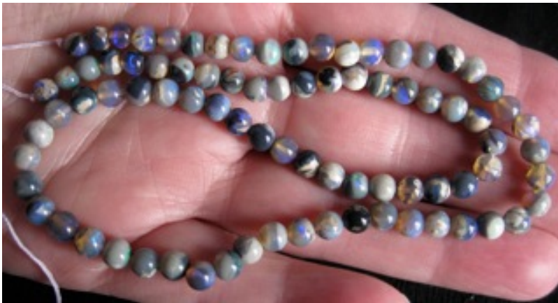
25. $375 IMG_6253 Lightning Ridge Blacks 5mm round 55cts