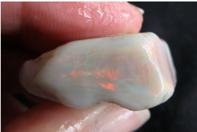
7. $306 IMG_0928 Dead Horse Gully $600/oz 33mm x 28mm x 14mm thick .51oz - a great stone