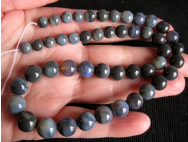
26. $393 IMG_5690 Lightning Ridge Black Opal 7-10mm round 171cts