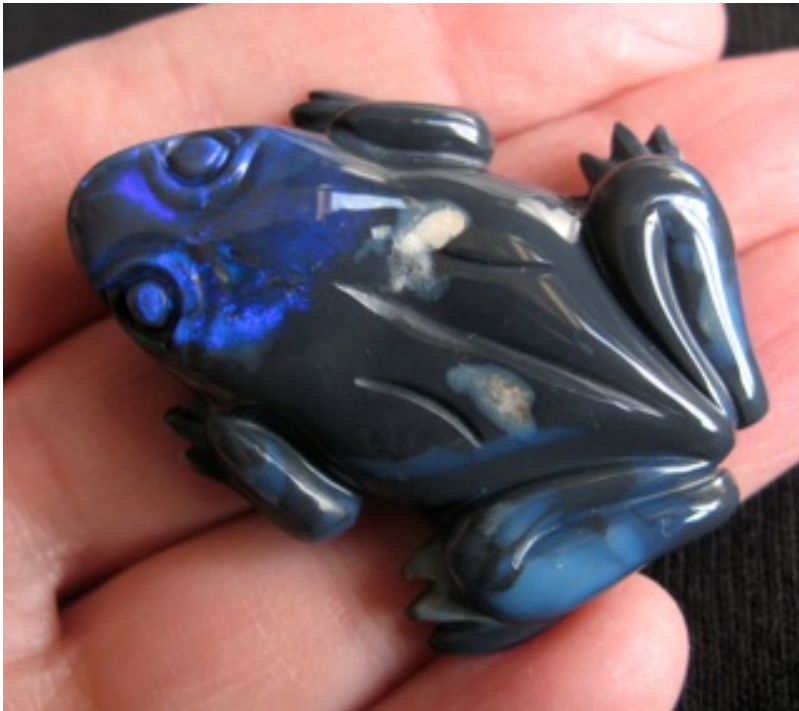
33. $295 IMG_9213 Lightning Ridge Black very large Frog 2" x 1.25" 72.38cts