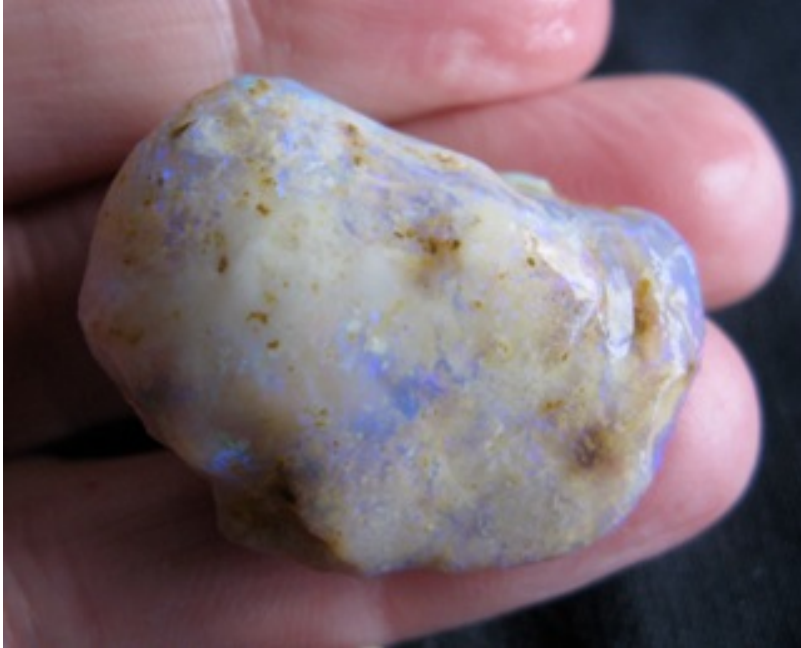
16. $900 IMG_0783 Shell Super Gem double sided 48.15cts