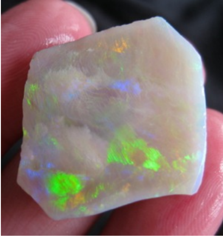
12. $700 IMG_0514 Mintubi Gem broad flash Green faced 24mm x 24mm $3,500/oz .2oz