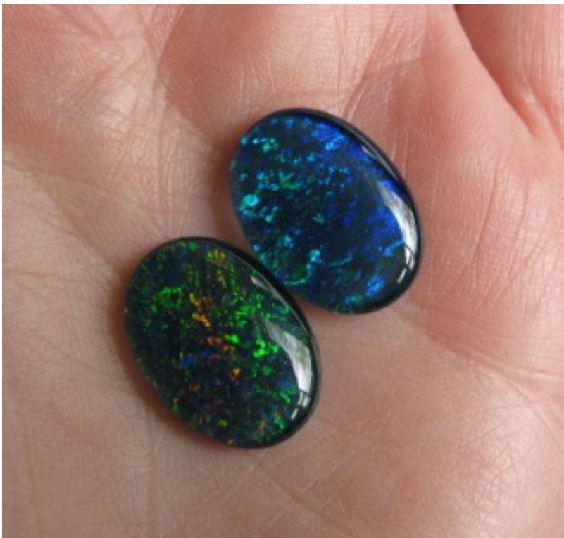
31. $87.50 each IMG_0792 Triplets 18mm x 13mm