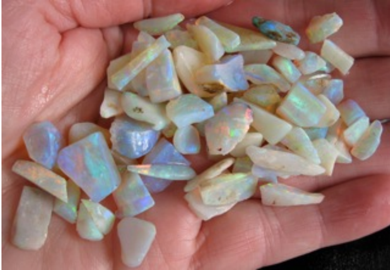
22. $1,250 (two grades together) IMG_9622 Andamooka small stones 65cts Grade #1