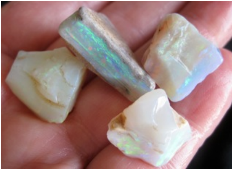
19. $946 IMG_0211 Mixed Gems $2,200/oz .43oz