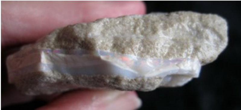
1. $40 IMG_9390 Mintubi Gem Bar Specimen

33. $295 IMG_9213 Lightning Ridge Black very large Frog 2" x 1.25" 72.38cts