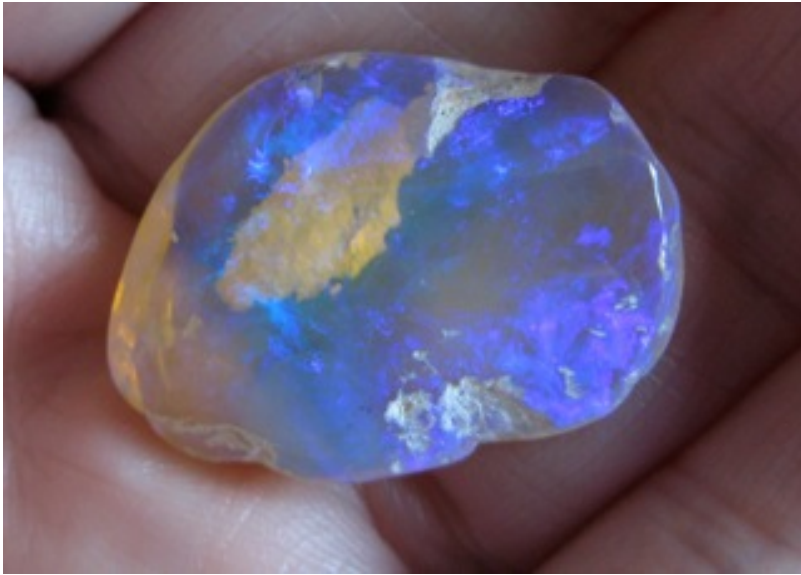
6. $182 IMG_7458 Lightning Ridge Crystal 24mm x 18mm 18.75cts