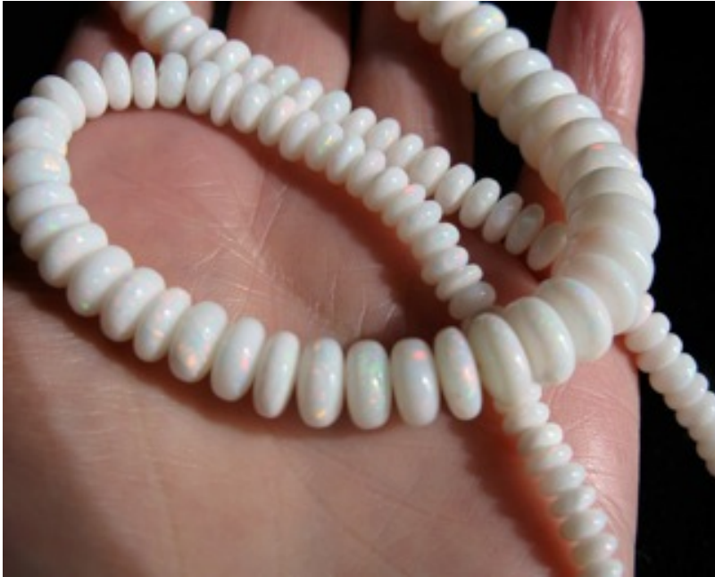
30. $2,750 IMG_9447 Mintubi White Base Reds & Greens 4-11mm rondel 135cts $15/ct