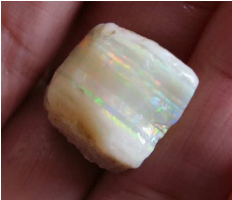
9. $434 IMG_0848 Mintubi (will cut 2 stones) $3,500/oz .124oz (more available refer to Xmas Special)