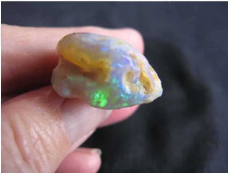
17. $900 IMG_0788 Shell Super Gem double sided 48.15cts