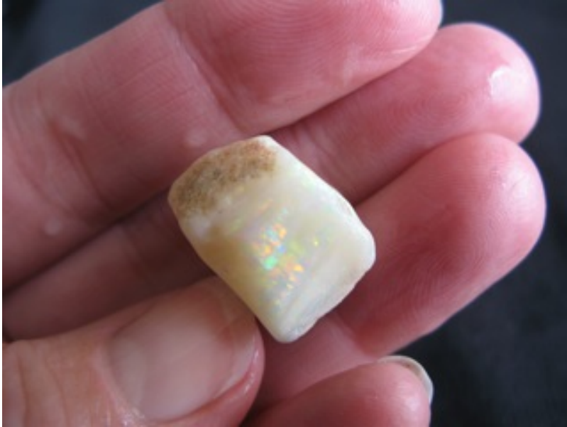
10. $434 IMG_0852 Mintubi (will cut 2 stones) $3,500/oz .124oz