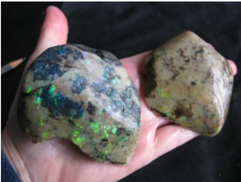
15. $845 IMG_0953 Andamooka Matrix 12.2oz