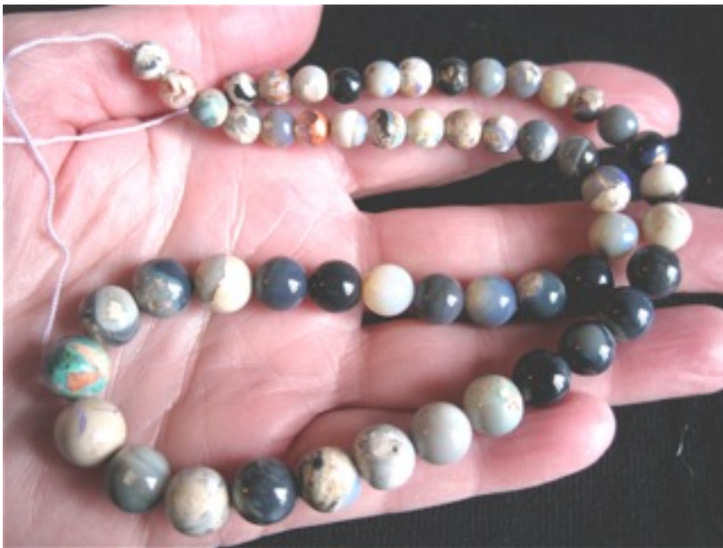
27. $448 IMG_5683 Lightning Ridge 7-11mm round 146cts