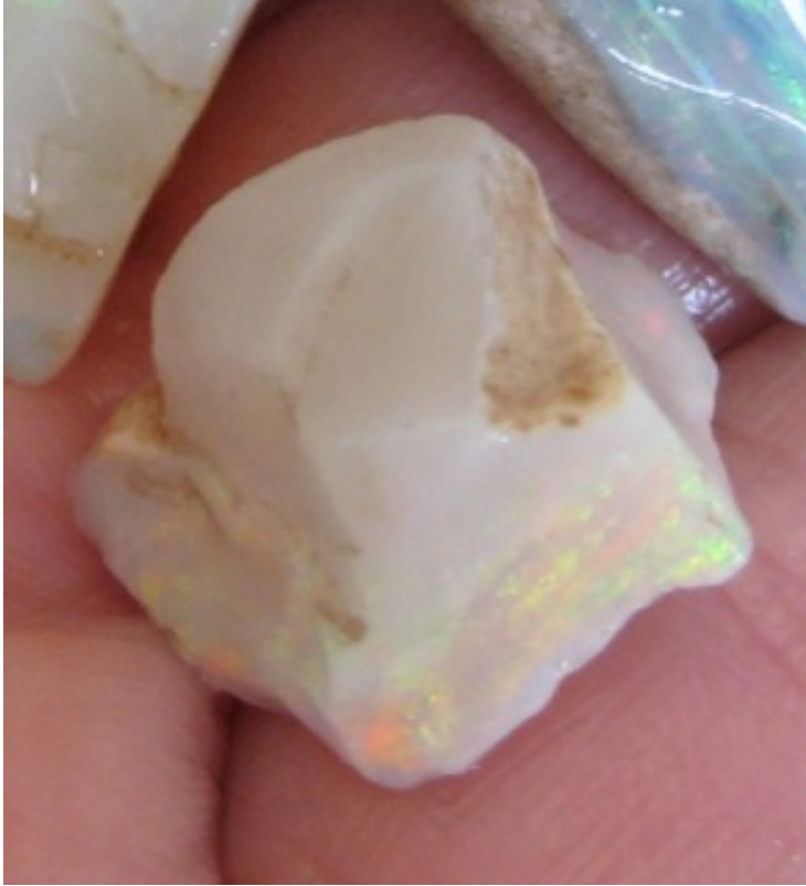
20. $946 IMG_0213 Mixed Gems $2,200/oz .43oz