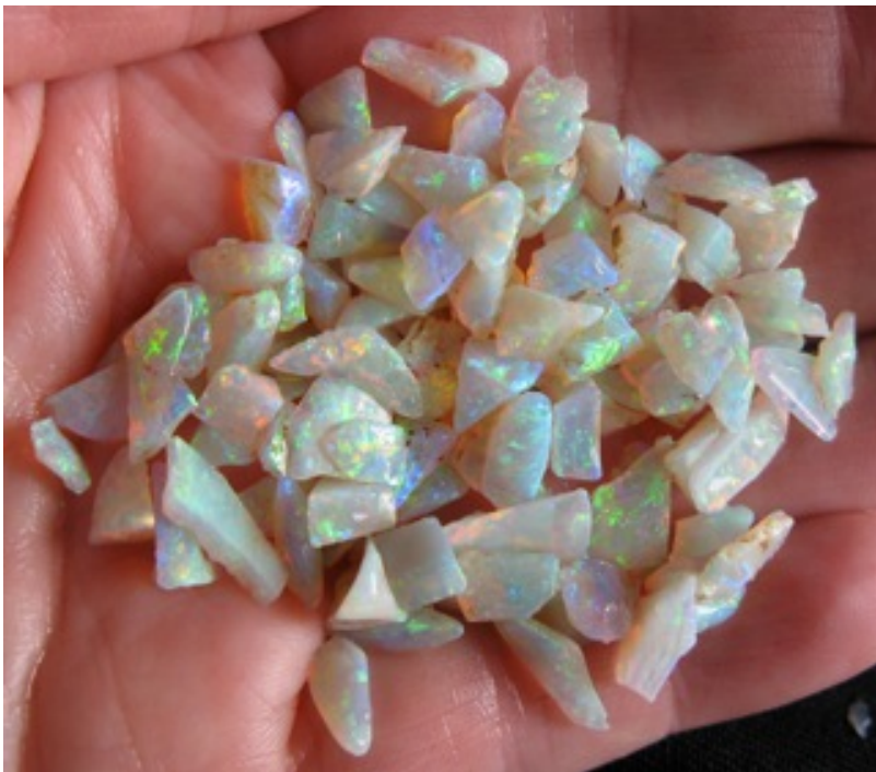
23. $1,250 (two grades together) IMG_9626 Andamooka small stones 65cts Grade #2