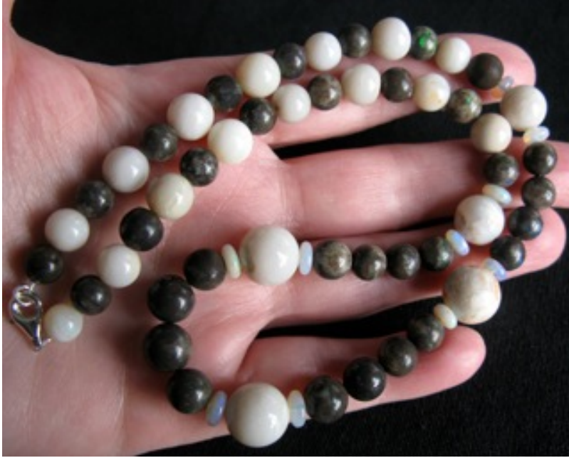
24. $260 IMG_9574 Andamooka Matrix, Coober Pedy and mixed rondels