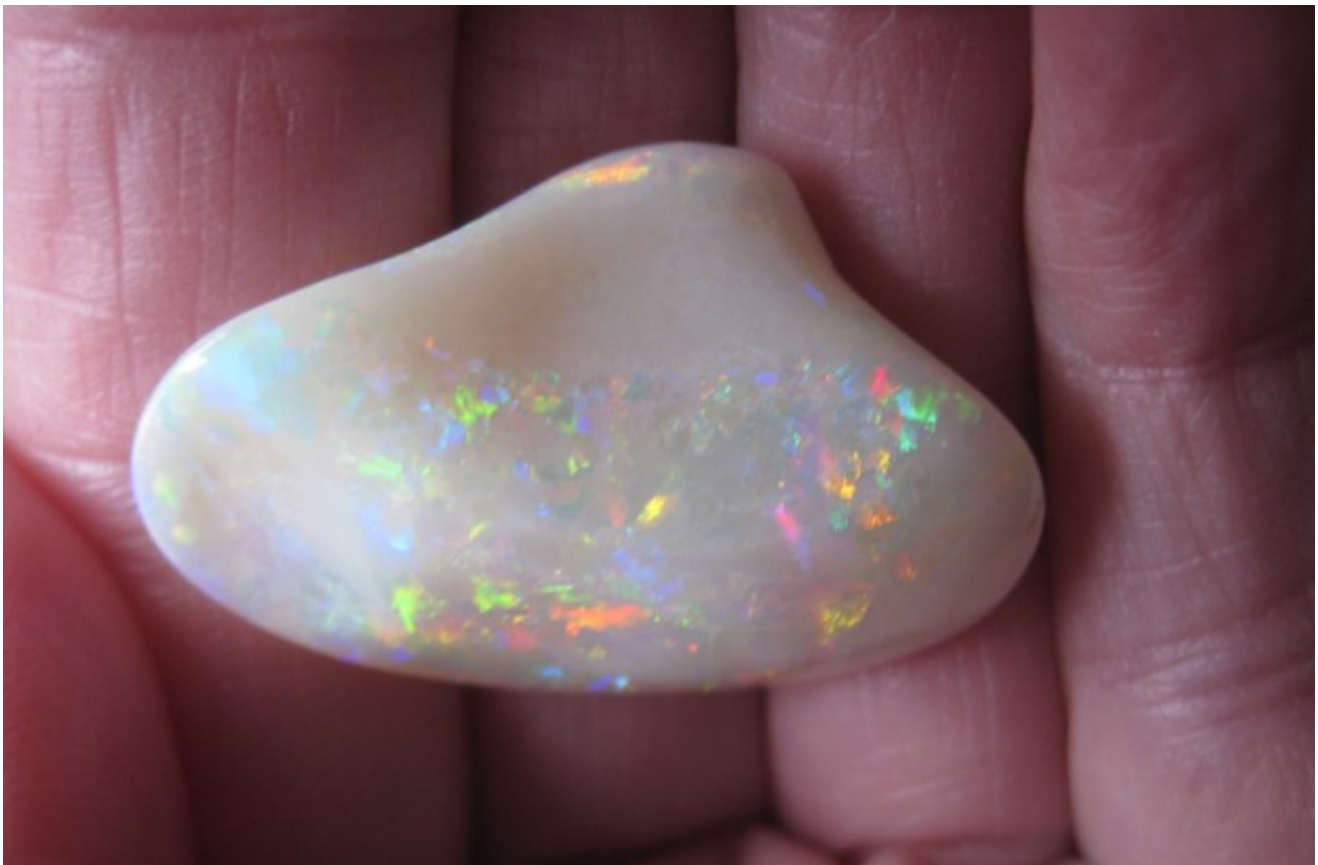
$650 IMG_4879 Gem Shell polished (cracked) 36.45cts