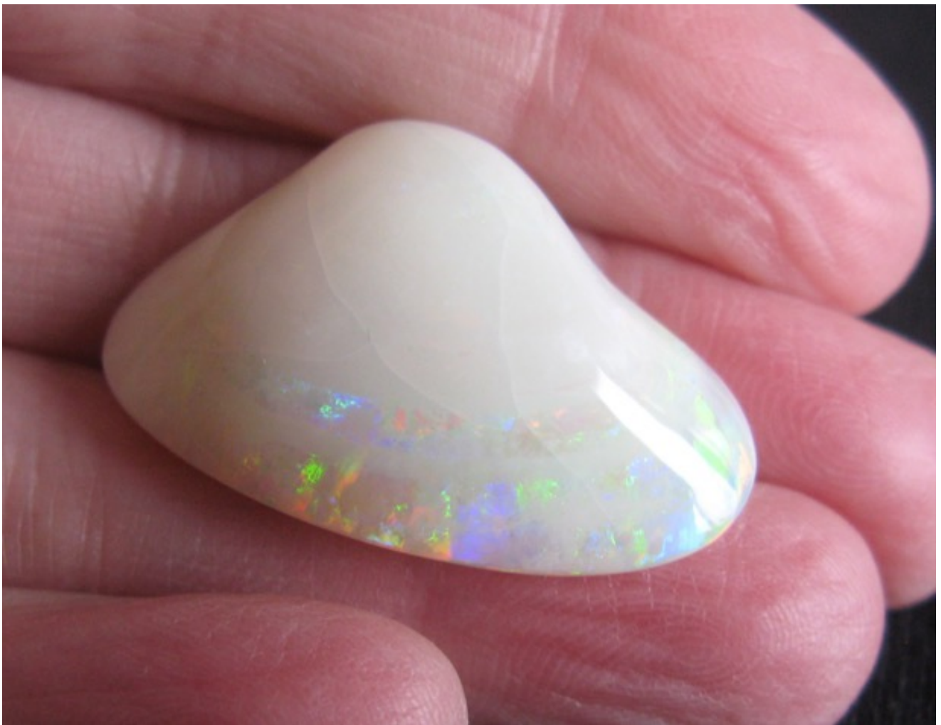
$650 IMG_2497 Gem Shell polished (cracked) 36.45cts