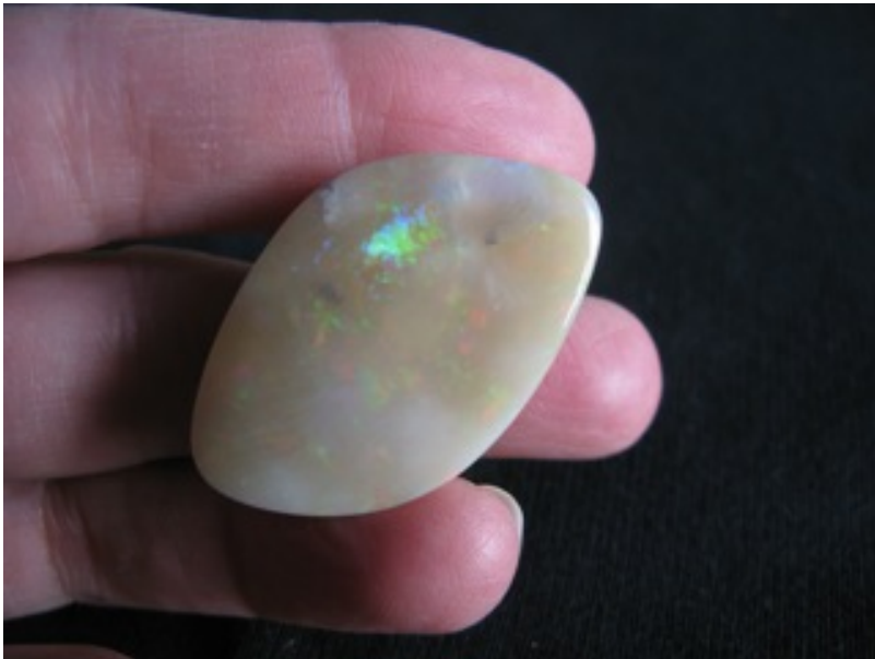
4. $98 IMG_7598 Mintubi on Sandstone 38mm x 24mm .26oz