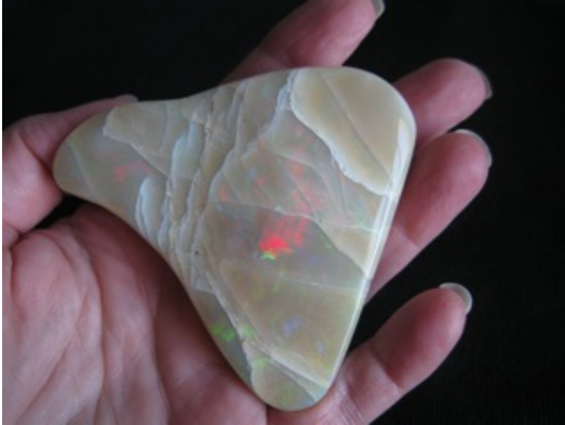
22. $435 IMG_8795 Mintubi on Sandstone brilliant 3" x 3" 3.2oz