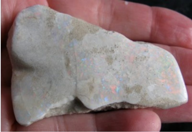
3. $60 IMG_3984 Mintubi Specimen approximately 6cm x 3cm