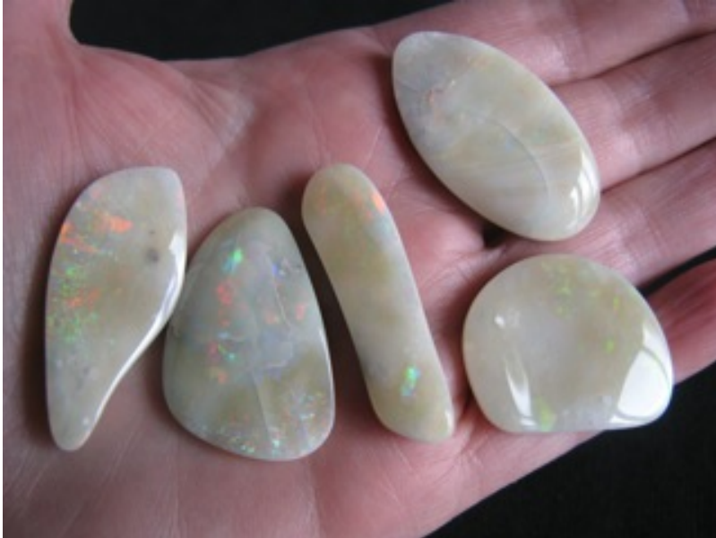
8. $175 or $35 each IMG_7663 Mintubi on Sandstone (5 stones) .769oz