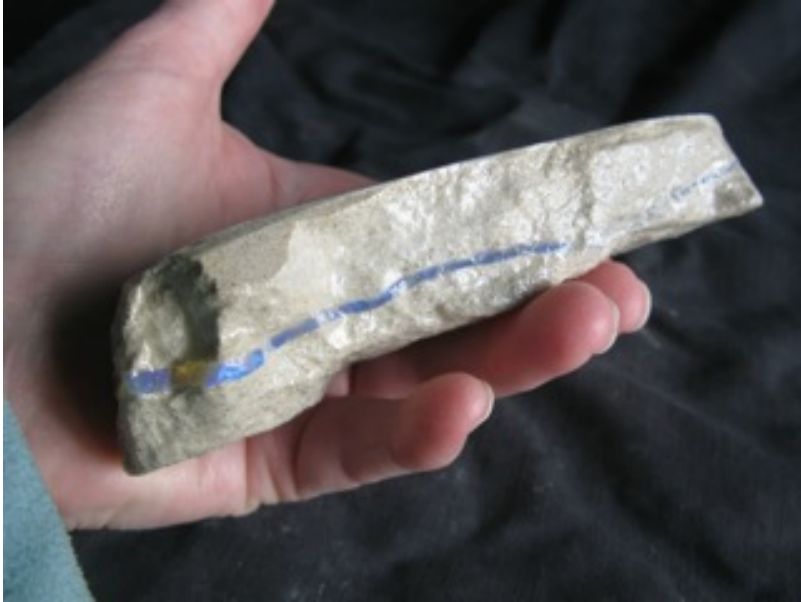
18. $325 IMG_7583 Mintubi Specimen double bar approx 14cm x 5cm x 2cm thick