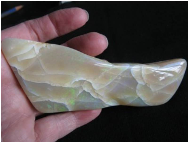
23. $435 IMG_7608 Mintubi on Sandstone jelly pinfire cut solids almost beautiful specimen 4." x 1.5" 3.1oz