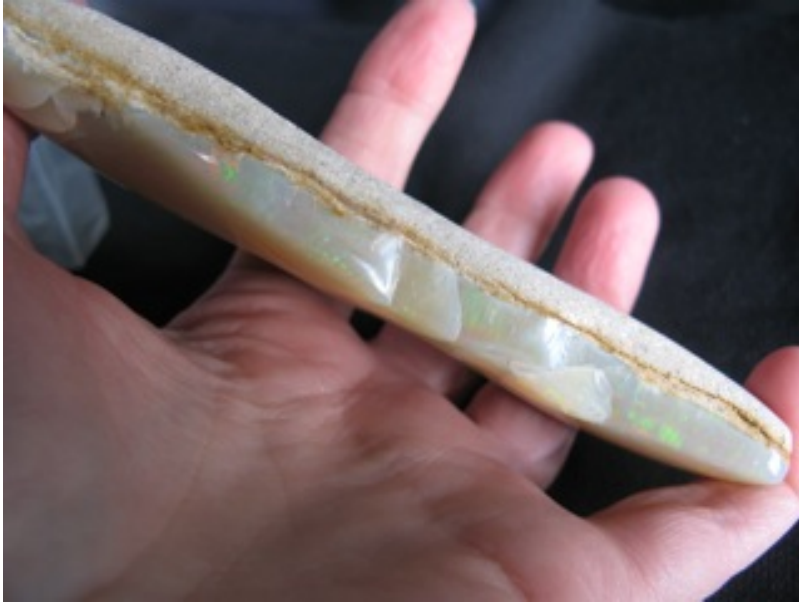
24. $435 IMG_7619 Mintubi on Sandstone jelly pinfire cut solids almost beautiful specimen 4." x 1.5" 3.1oz