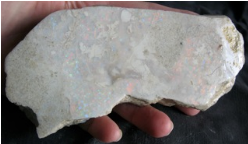
17. $325 IMG_7578 Mintubi Specimen double bar approx 14cm x 5cm x 2cm thick