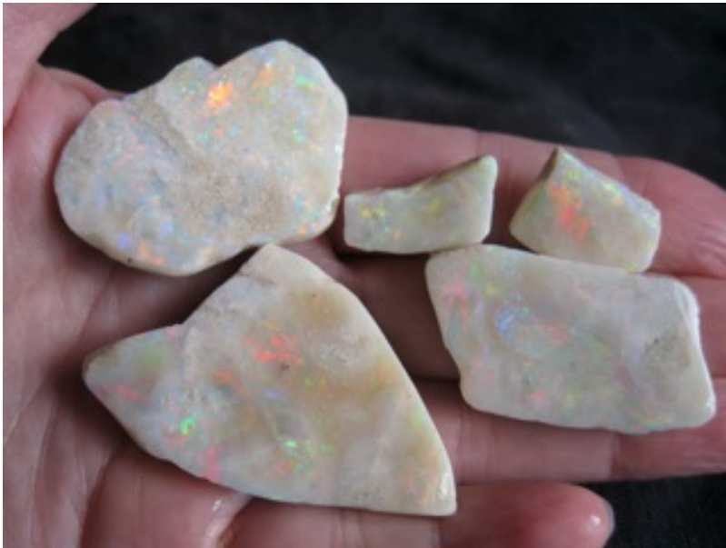
26. $560 IMG_3170 Mintubi Faced on Sandstone $400/oz 1.4oz