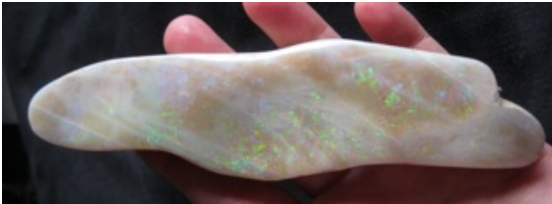
25. $535 IMG_0958 Mintubi Gem Specimen approximately 5.5" x 1.25"