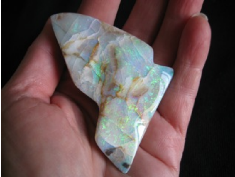
14. $265 IMG_8697 Mintubi on Sandstone 3" x 1" 1.4oz