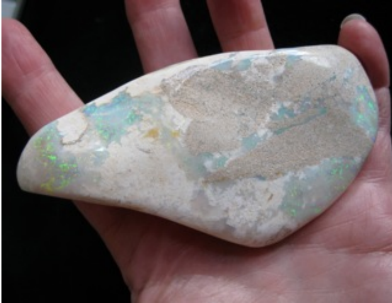
16. $285 IMG_8687 Mintubi on Sandstone some gems double sided 4" x 2" 3.15oz