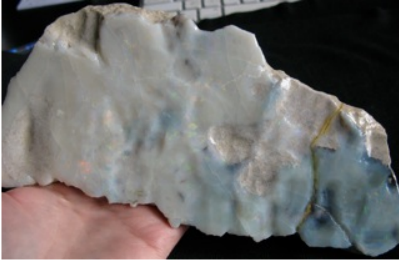
29. $650 IMG_7652 Mintubi Black & White specimen approx 19cm x 8cm x 1cm thick