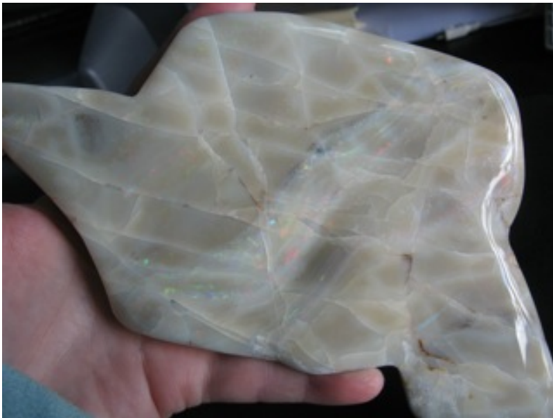
28. $625 IMG_7591 Mintubi on Sandstone specimen multi colour 5" x 6" 16.2oz