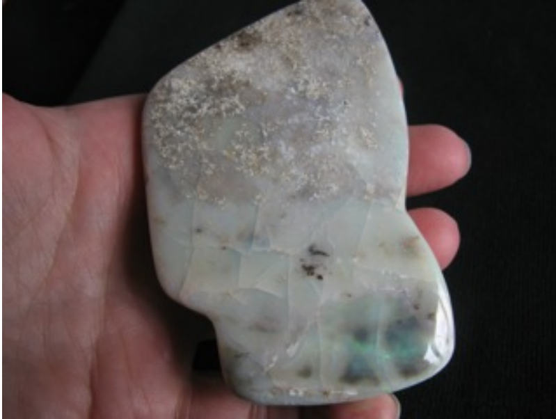
1. $35 IMG_7660 Mintubi on Sandstone specimen 3.5" x 2" 4.25oz