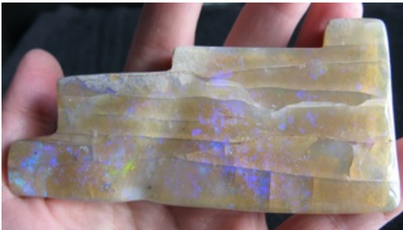
21. $375 IMG_7595 Mintubi on Sandstone brilliant blue & green jelly 4.3" x 1.5" 3.09oz