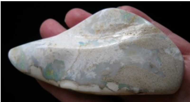
15. $285 IMG_8686 Mintubi on Sandstone some gems double sided 4" x 2" 3.15oz (side 1)