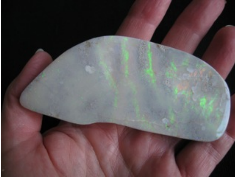
12. $240 IMG_8793 Mintubi on Sandstone Specimen 4" x 1.5" 2.85oz