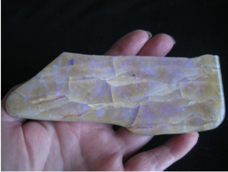
20. $350 IMG_8791 Mintubi on Sandstone purples 5.5" x 1.75" 4.75oz