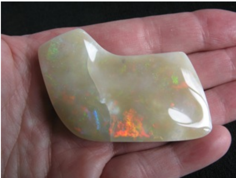
19. $335 IMG_7637 Mintubi on Sandstone Gem Reds & Greens 2" x 1.1" cut great stones