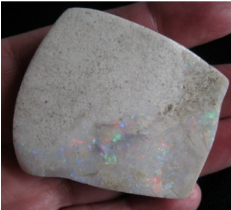
9. $195 IMG_3278 Mintubi Gem Bar Specimen 2.2oz