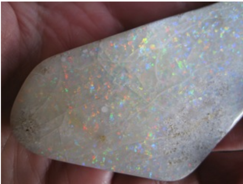
11. $235 IMG_8701 Mintubi on Sandstone 3.75" x 1.5" 2.55oz