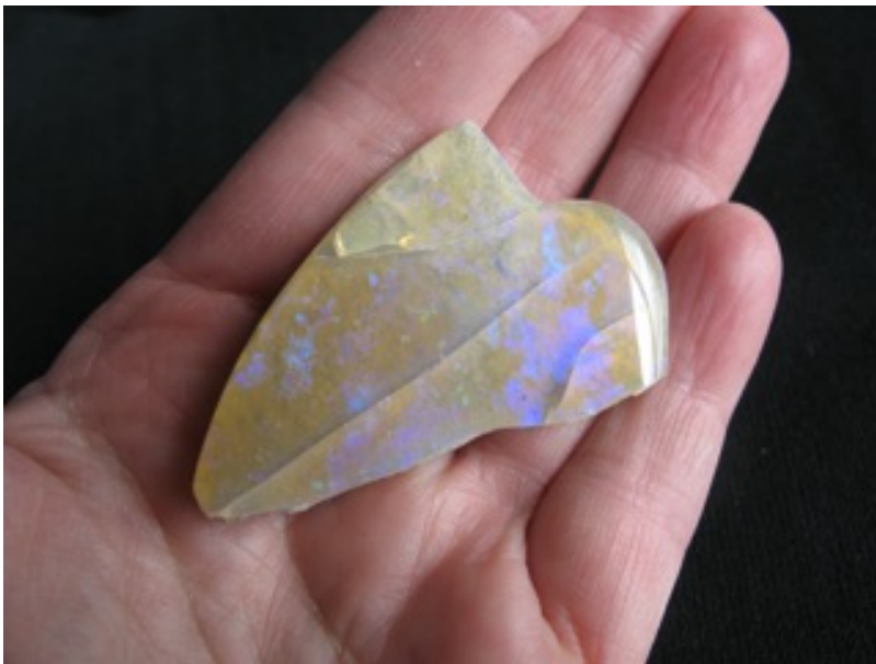
2. $46 IMG_7632 Mintubi on Sandstone Jelly Blue & Green 1.5" x 1" . 69oz