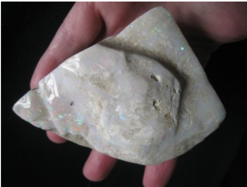
13. $265 IMG_3286 Mintubi Gem Bar Specimen 7.75oz