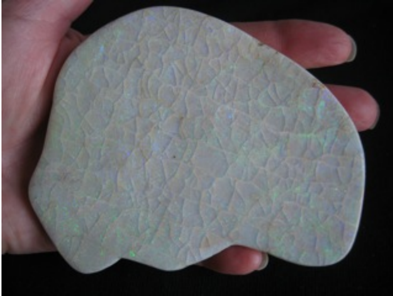
10. $235 IMG_8786 Mintubi on Sandstone 7.65oz