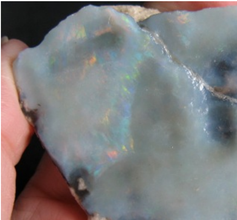
30. $650 IMG_7653 Mintubi Black & White specimen approx 19cm x 8cm x 1cm thick