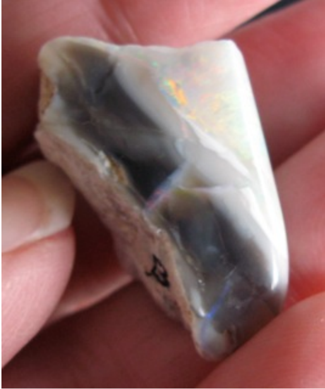
15. $112 IMG_8187 Lightning Ridge Reds & Greens on Black 37.65cts