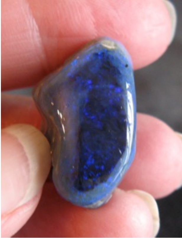
11. $98 IMG_8168 Lightning Ridge Black Noble dark blues 43.5cts