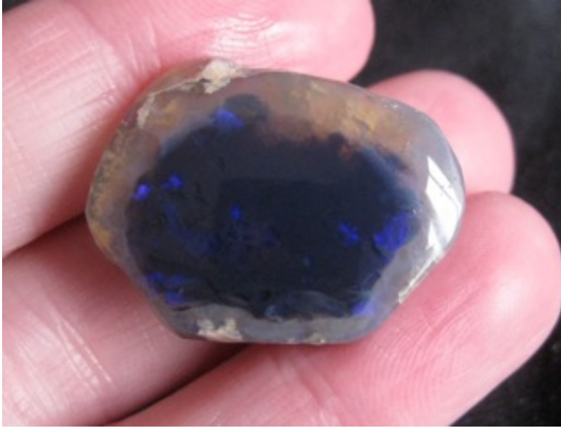
19. $135 IMG_3864 Lightning Ridge Black deep Blues on Black 39.3cts