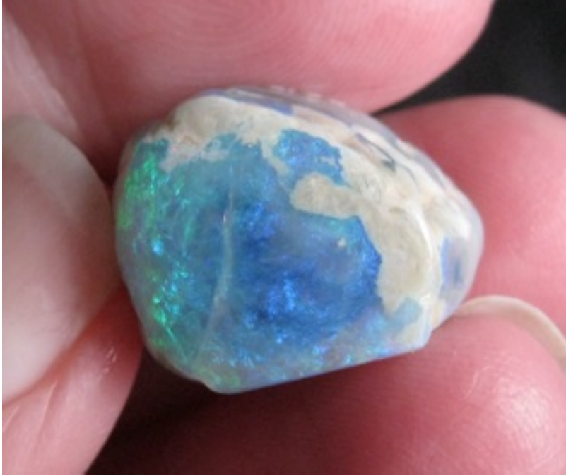
5. $70 IMG_3868 Lightning Ridge Nobbie Greens 18.55cts