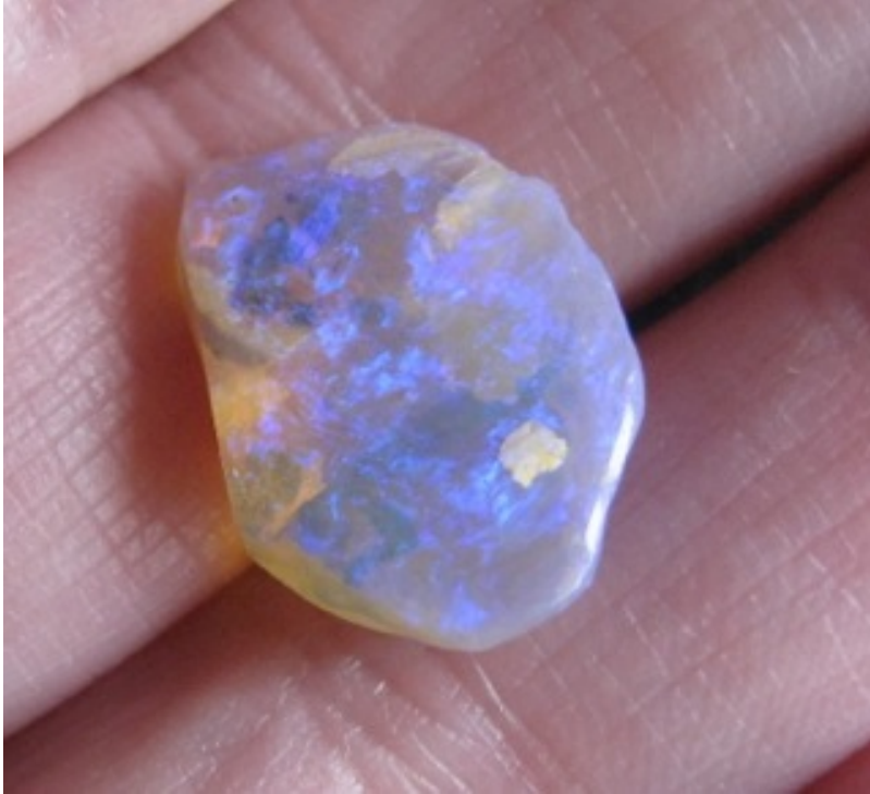
3. $63 IMG_3860 Lightning Ridge Blue Crystal to cut a solid 7.3cts