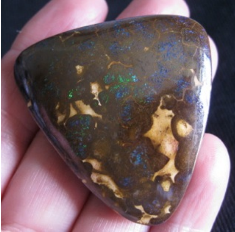
26. $75 IMG_9520 Boulder Matrix Opal 46mm x 46mm 201cts 1.29oz