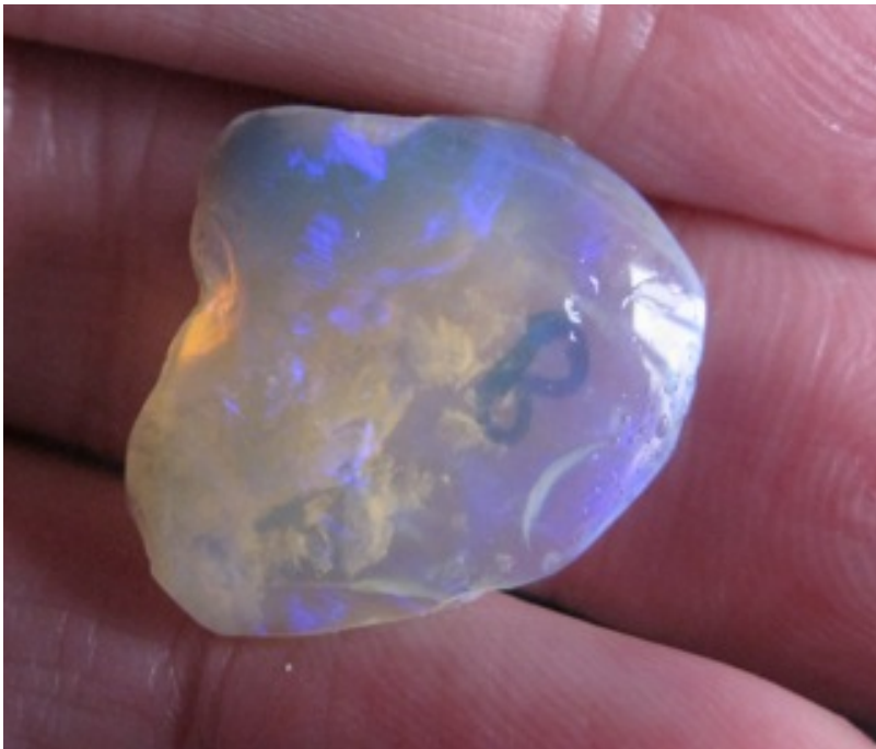
2. $53 IMG_3903 Lightning Ridge Crystal Light Blues 10.65cts