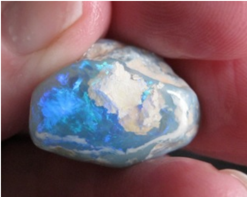
12. $99 IMG_3849 Lightning Ridge brilliant faced Blue Green Nobbie 26.3cts