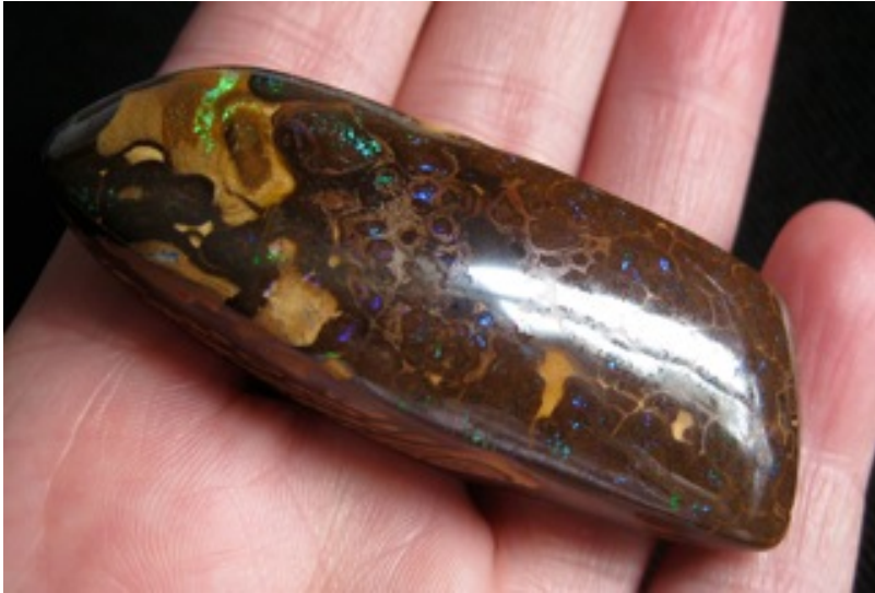
28. $225 IMG_9498 Boulder Matrix Opal beautiful colour on face 63mm x 23mm 207cts 1.33oz