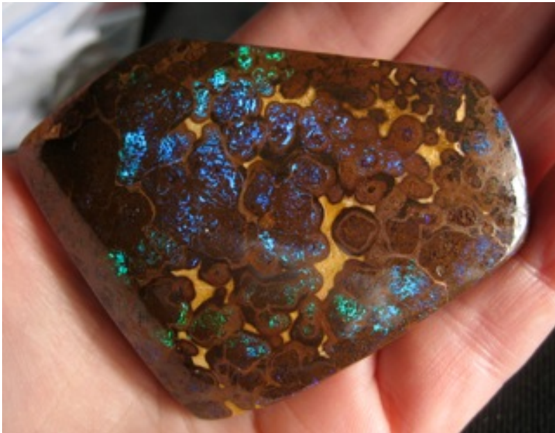
29. $425 IMG_9446 Boulder Matrix Opal, beautiful colour specimen 60mm x 53mm 542cts 3.25oz