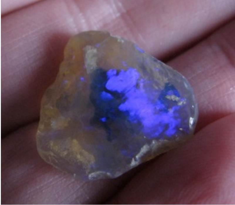
1. $52 IMG_3884 Lightning Ridge Blue Crystal 12.75cts