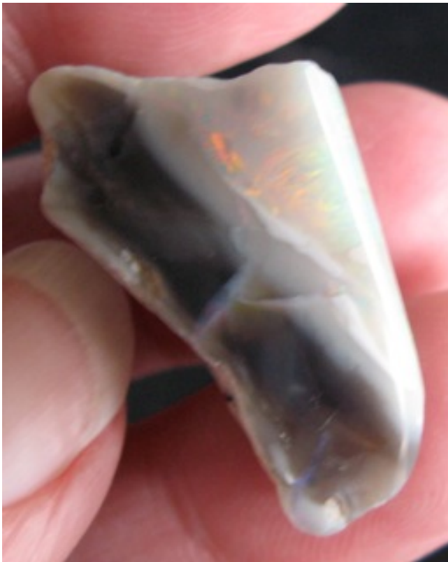
14. $112 IMG_8186 Lightning Ridge Reds & Greens on Black 37.65cts