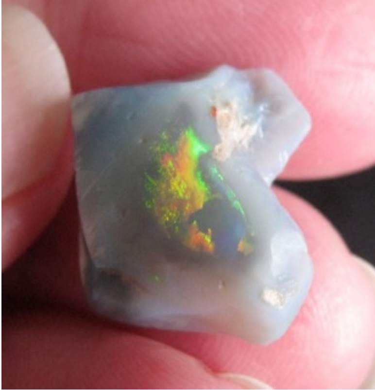
7. $72 IMG_3874 Lightning Ridge beautiful multicolour broad flash 9.7cts