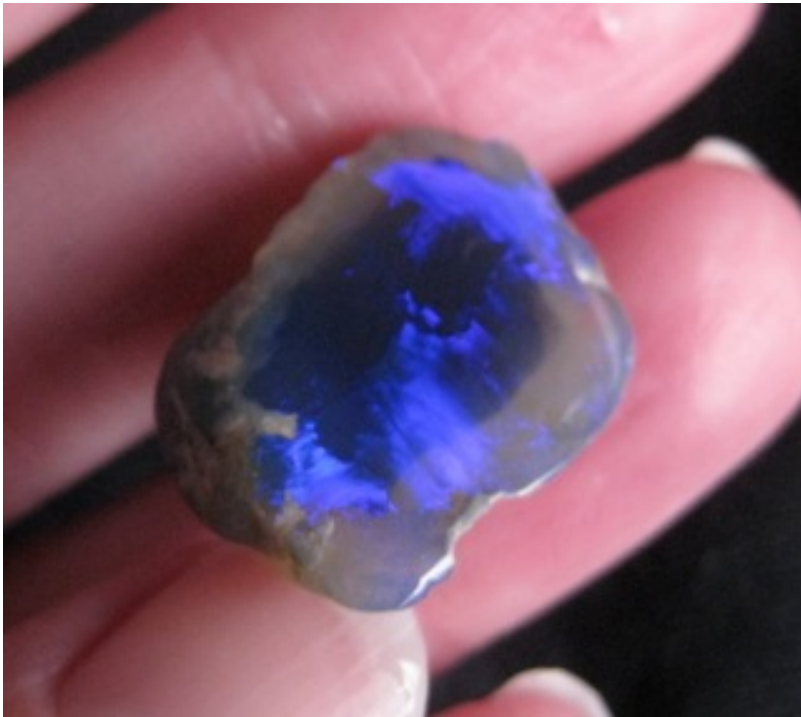
20. $145 IMG_3885 Lightning Ridge Black brilliant Dark Blues 18.45cts