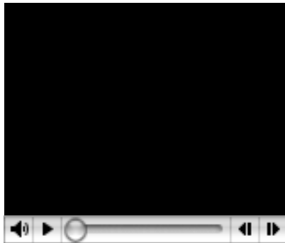
Video Clip #21 and 24.

24. $156 IMG_8217 Lightning Ridge Jet Black double sided Blue Green one side and Gems the other 14.15cts