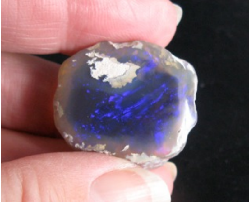
17. $119 IMG_8185 Lightning Ridge Black Nobbie dark blues 55.65cts