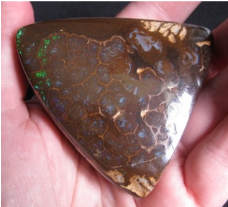
27. $78 IMG_9492 Boulder Matrix Opal triangle 62mm x 61mm 496cts 3.2oz