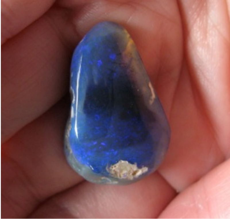
13. $100 IMG_8205 Lightning Ridge Black Nobbie dark blues 40.7cts