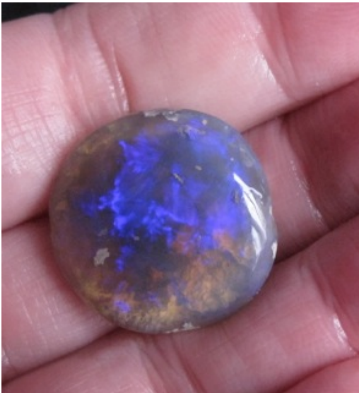
18. $134 IMG_3851 Lightning Ridge Dark Crystal Blues 29.2cts