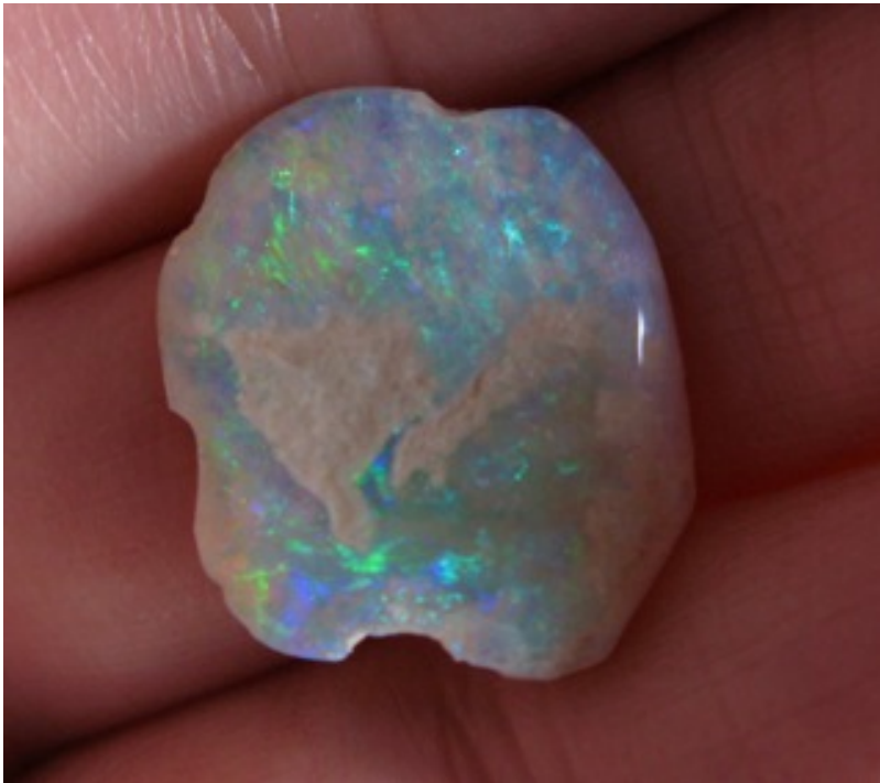
4. $68 IMG_8201 Lightning Ridge Crystal Greens some Golds 81cts