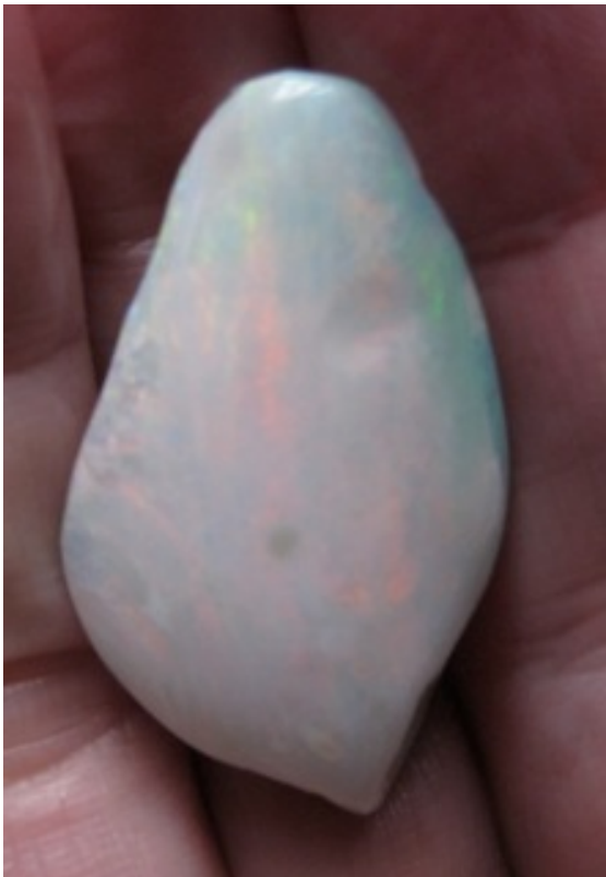
6. $70 IMG_3854 Lightning Ridge Light Base make a super pendant 28.55cts