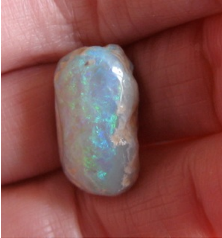
16. $147 IMG_8032 Lightning Ridge Crystal ready shaped for a gem ring 13.5cts