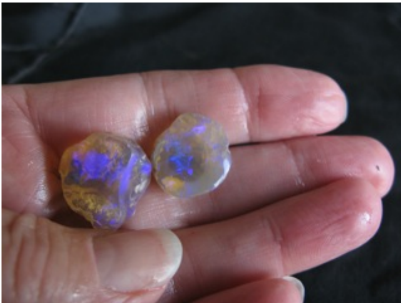
15. $143 IMG_8030 Lightning Ridge great Blue Crystals make a beautiful pair of earrings (2) 23cts