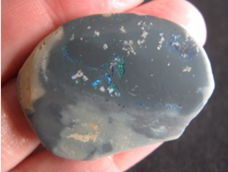
2. $42 IMG_0016 Lightning Ridge 41.5cts