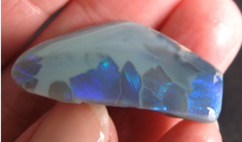
6. $76 IMG_0030 Lightning Ridge Black broad brilliant patterns blue green 23.4cts