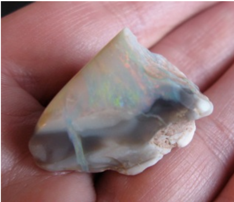
9. $112 IMG_8176 Lightning Ridge Reds & Greens on Black 37.65cts