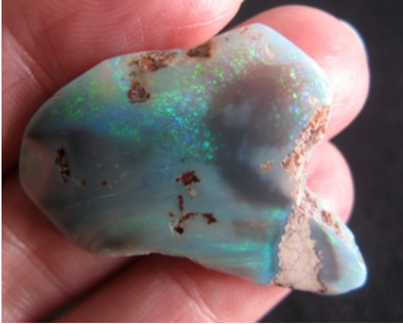
8. $99 IMG_0037 Lightning Ridge some colour both sides 20.7cts