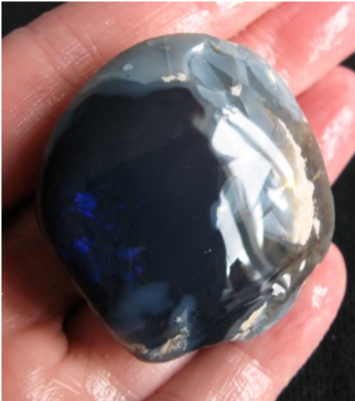
11. $135 IMG_0039 Lightning Ridged faced Black Nobbie 186cts