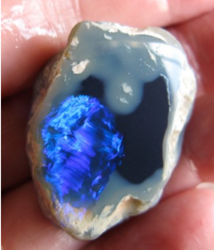
18. $175 IMG_8041 Lightning Ridge Cab or carved Black Opal an absolute beauty 79.8cts