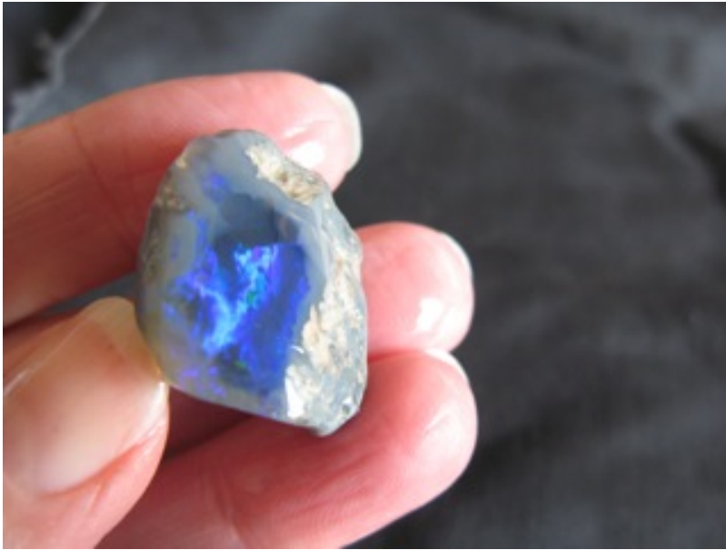
14. $135 IMG_8028 Lightning Ridge Black very bright stone 29.3cts