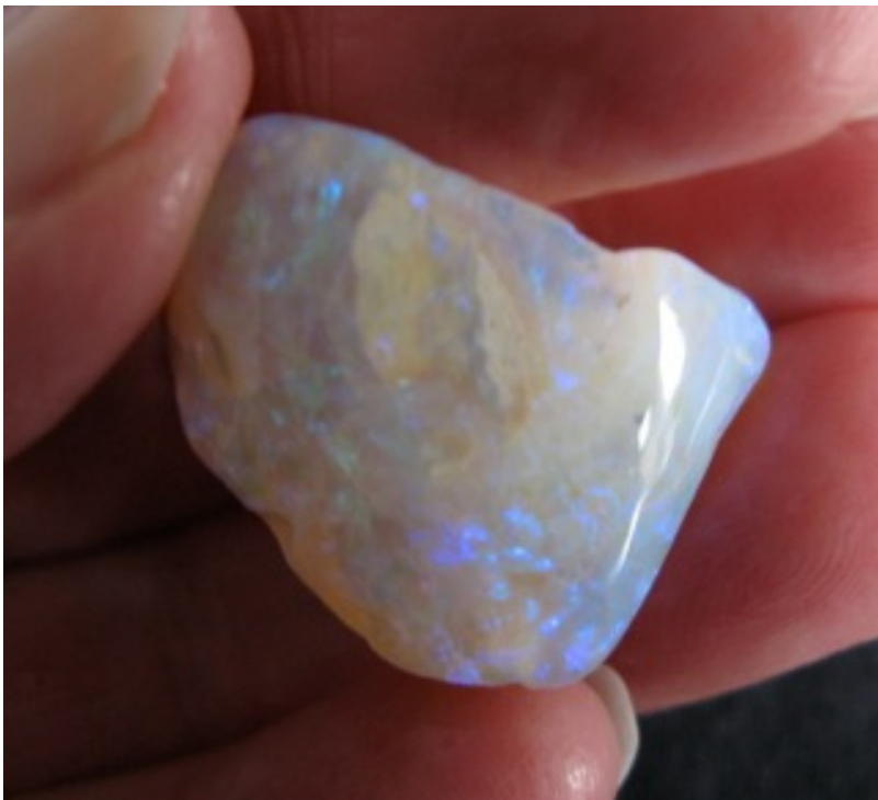
5. $73 IMG_0027 Lightning Ridge full colour 30.8cts