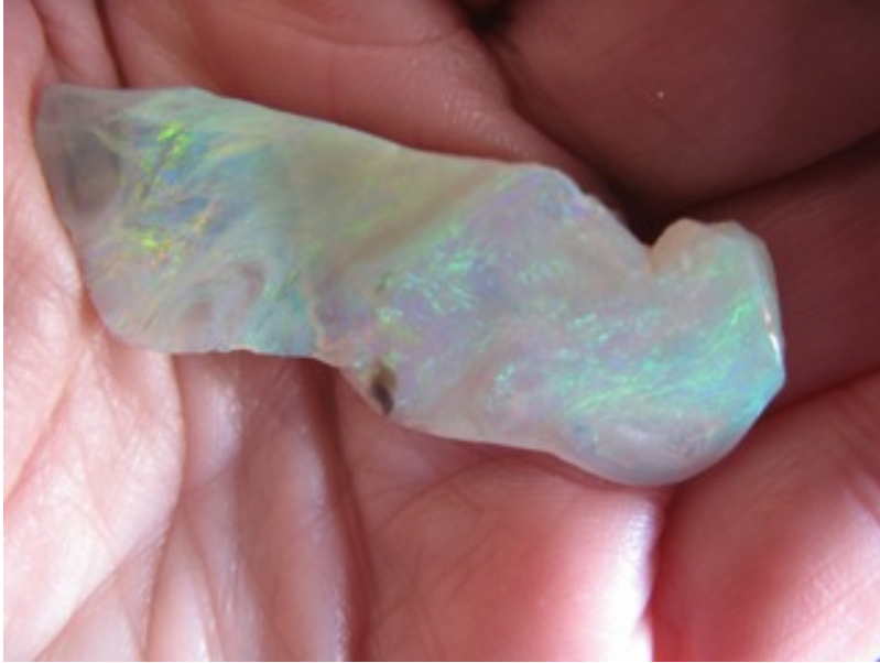
12. $107 IMG_8022 Lightning Ridge double sided good for freeform solid or brilliant carving 19.6cts