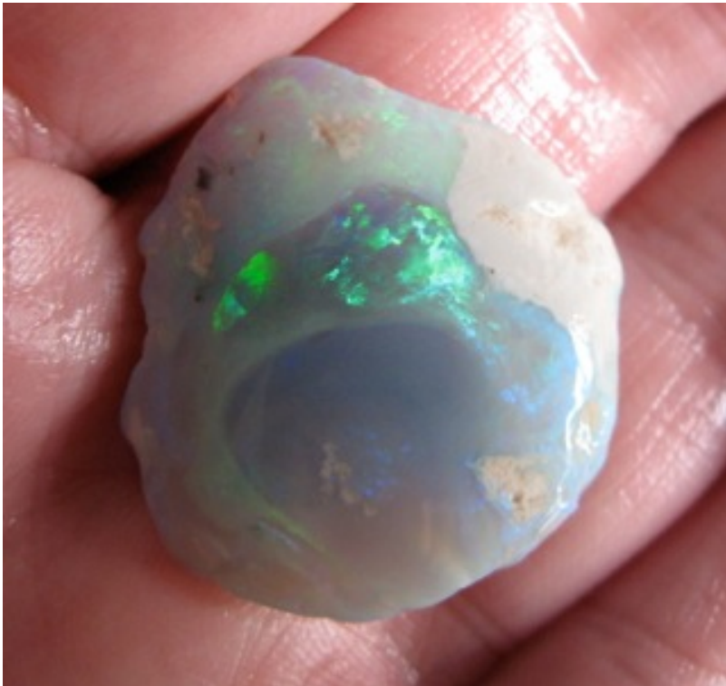
7. $96 IMG_0035 Lightning Ridge brilliant gem colours 20.95cts