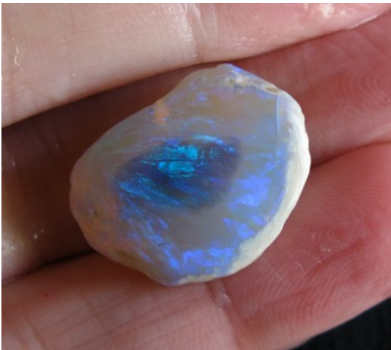
13. $126 IMG_8023 Lightning Ridge Crystal solid colour 8-11mm thick 19.8cts