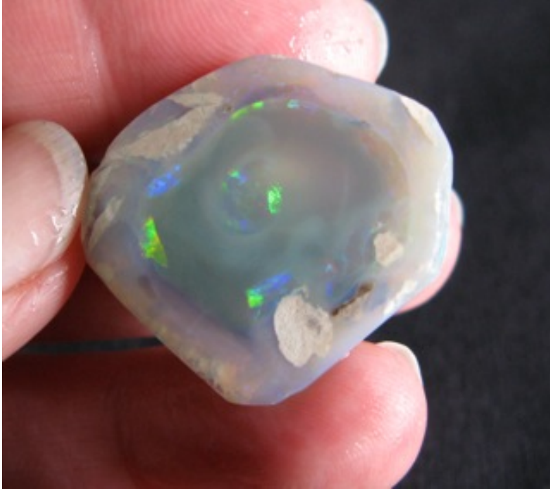
4. $70 IMG_0021 Lightning Ridge Nobbie suit carving 34.98cts