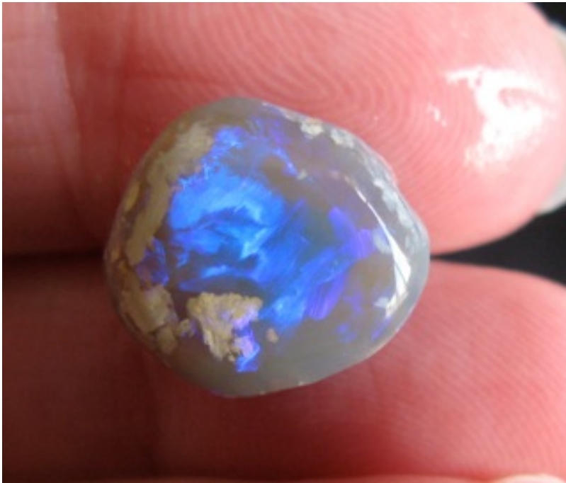
17. $160 IMG_8038 Lightning Ridge Black make a very beautiful ring stone 7.69cts