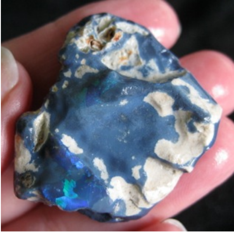
10. $125 IMG_7658 Lightning Ridge Black Opal .6oz