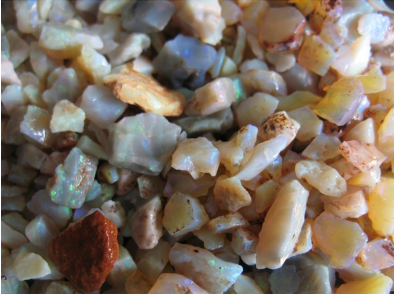
2. $1,800 IMG_7783 Lambina very bright $150/oz 12oz (including 2.5oz Dark Base that will cut gems) grade #1 parcel