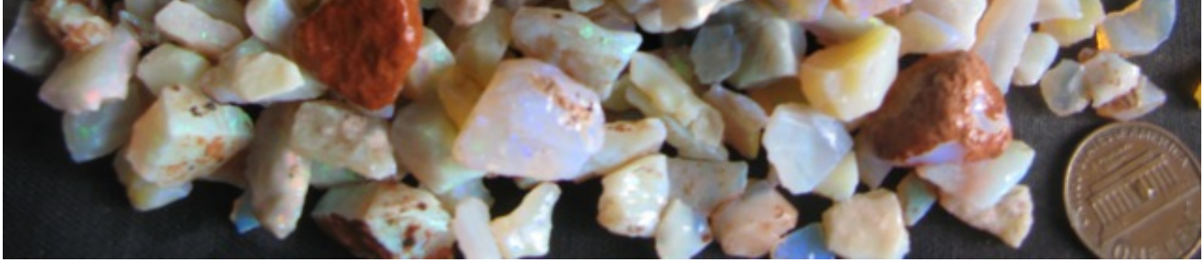
1. $1,800 IMG_7782 Lambina very bright $150/oz 12oz (including 2.5oz Dark Base that will cut gems) grade #1 parcel