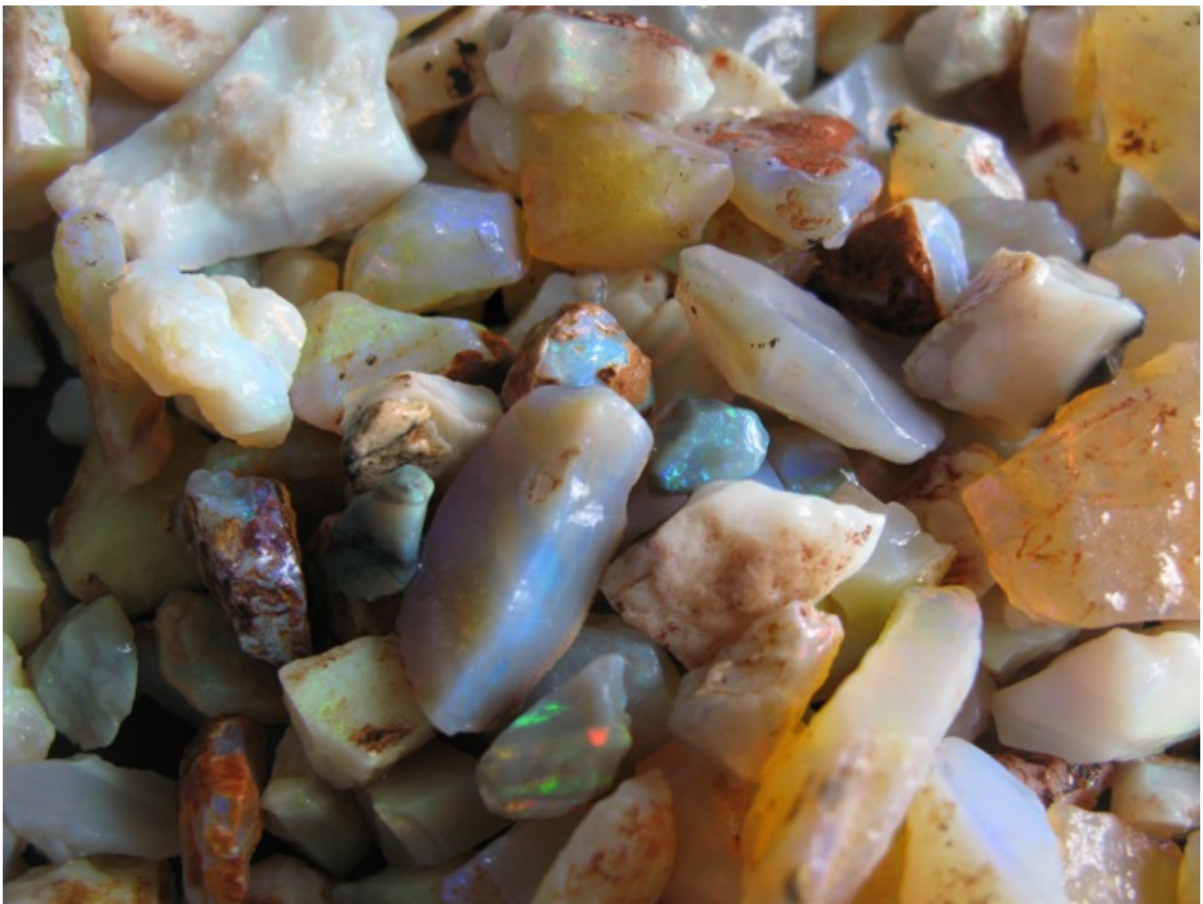
5. $1,750 IMG_7796 Lambina $125/oz 14oz beautiful purples, reds, golds & greens grade #2 parcel