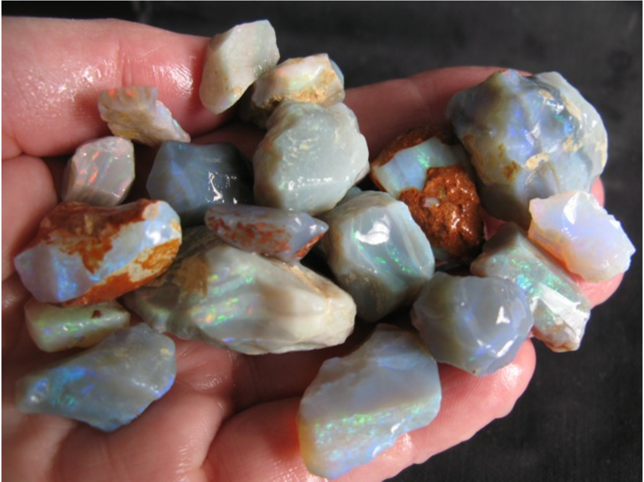
3. $1,800 IMG_7787 Lambina very bright $150/oz 12oz (including 2.5oz Dark Base that will cut gems) grade #1 parcel