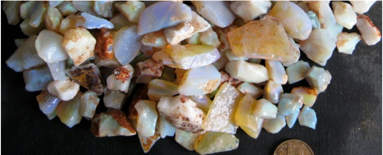
4. $1,750 IMG_7790 Lambina $125/oz 14oz beautiful purples, reds, golds & greens grade #2 parcel