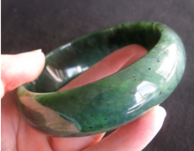
$350 IMG_8861 Jade gem bangle 7.5cm (3") diameter 4.1oz