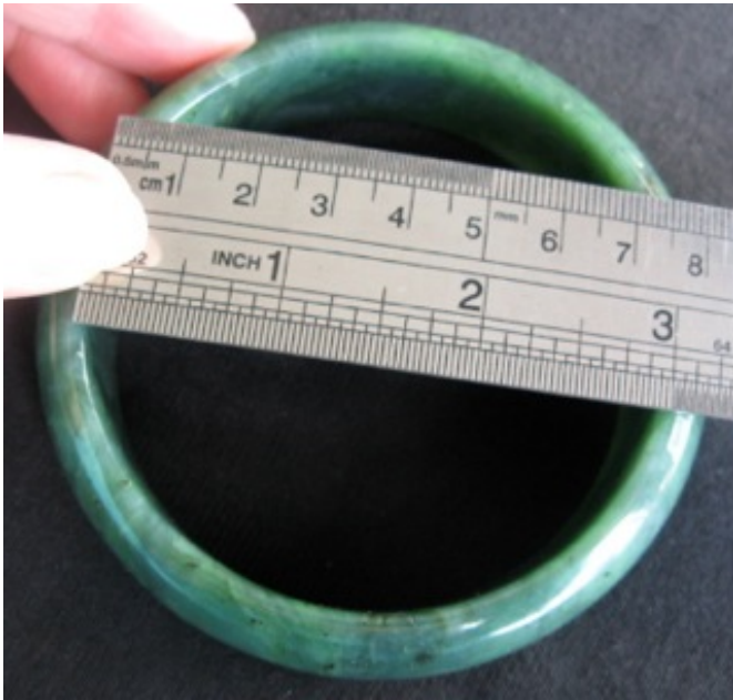
$350 IMG_8864 Jade gem bangle 7.5cm (3") diameter 4.1oz