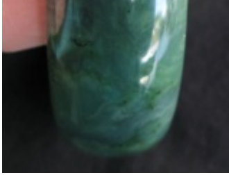
$350 IMG_8865 Jade gem bangle 7.5cm (3") diameter 4.1oz