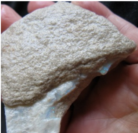
10. $49 IMG_9626 Mintubi Gem Green Bar Specimen 2.45oz