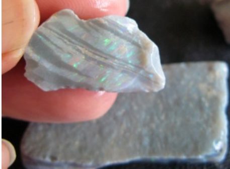
25. $392 IMG_9650 SPECIAL Mintubi Black $400/oz .98oz