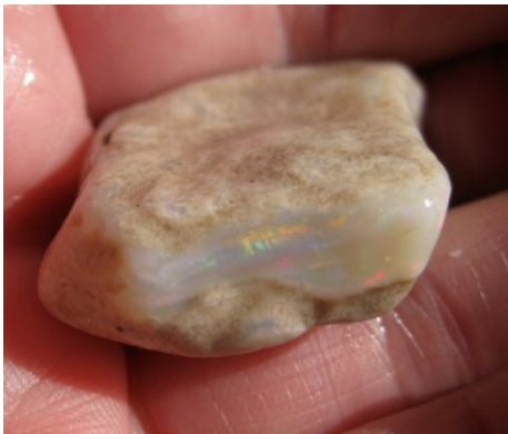
11. $50 IMG_1118 Mintubi on Sandstone $125/oz .4oz