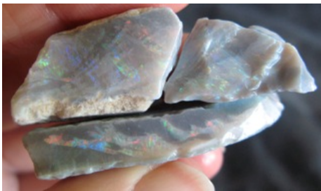
23. $392 IMG_9646 SPECIAL Mintubi Black $400/oz .98oz