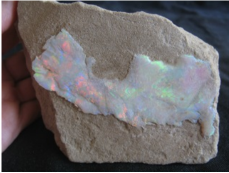
30. $1,000 IMG_9665 Mintubi Gem specimen - will stand 19.8oz