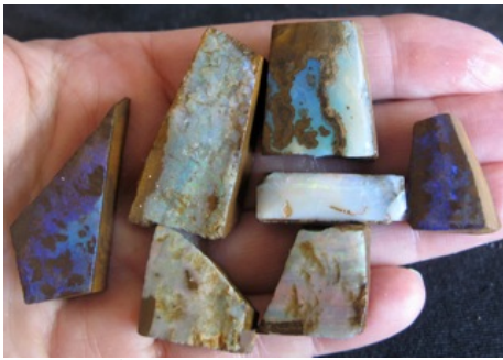
22. $200 the lot IMG_9662 Boulder opals (7)