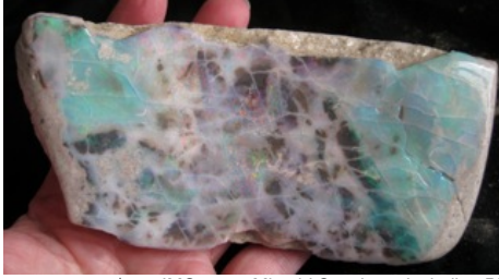
29. $895 IMG_1140 Mintubi Specimen including Black approx 12cm x 6cm x 1.5cm thick