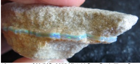
12. $60 IMG_9655 Mintubi Gem Bar brilliant Greens specimen 3.2oz