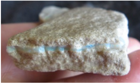
9. $49 IMG_9625 Mintubi Gem Green Bar Specimen 2.45oz