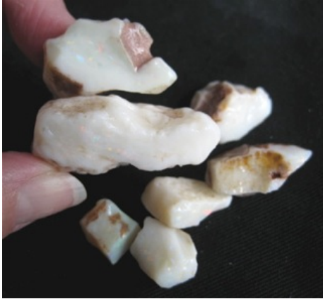
16. $75 IMG_4467 Hans Peak Reds & Greens 1oz