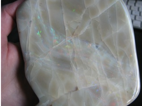
27. $625 IMG_7588 Mintubi on Sandstone specimen multi colour 5" x 6" 16.2oz