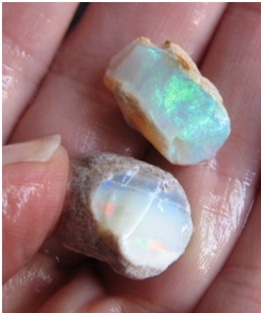
15. $72 IMG_9688 Coober Pedy Belemnites (2 part opal pipes) both with brilliant colours $500/oz .144oz