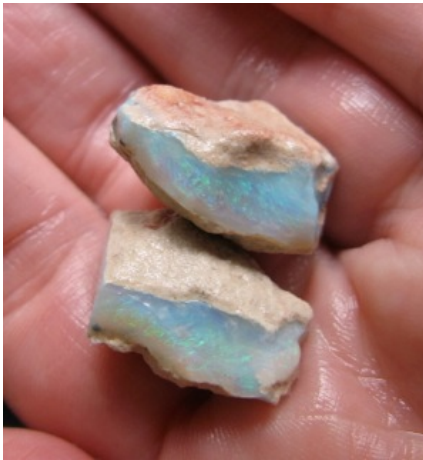
1. $11.20 IMG_3228 SPECIAL Coober Pedy .227oz