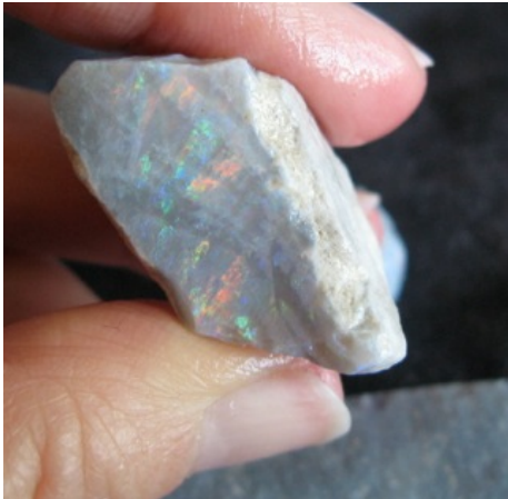
26. $392 IMG_9651 SPECIAL Mintubi Black $400/oz .98oz