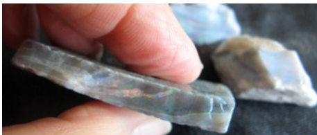
24. $392 IMG_9649 SPECIAL Mintubi Black $400/oz .98oz