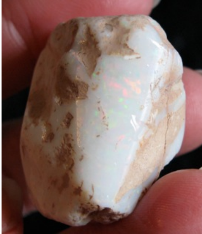
20. $135.80 IMG_9909 Coober Pedy Reds & Greens $200/oz .679oz