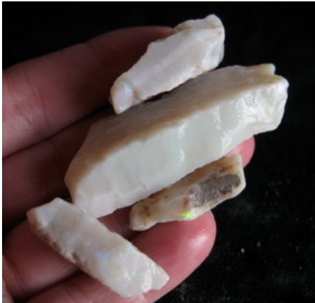
14. $67.20 IMG_1196 Coober Pedy White Base Reds & Greens $70/oz .96oz