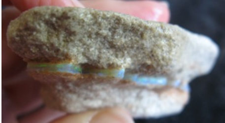
13. $60 IMG_9656 Mintubi Gem Bar brilliant Greens specimen 3.2oz