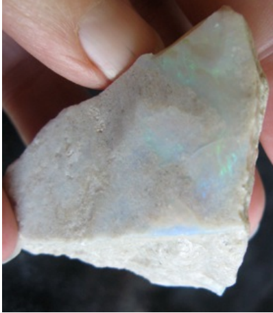
8. $45 IMG_9641 Mintubi Specimen some gem double sided .995oz