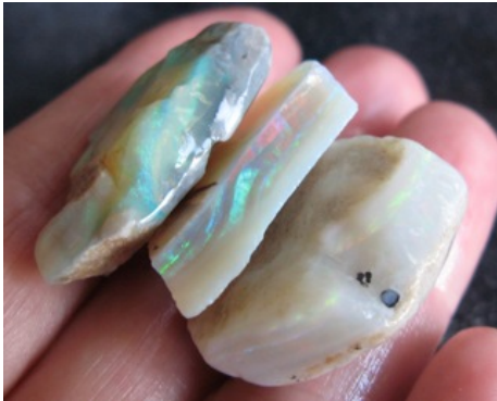
17. $93.75 IMG_9694 Mintubi $150/oz .625oz