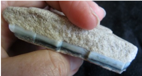
18. $100 IMG_9630 Mintubi Black opal specimen 3.2oz