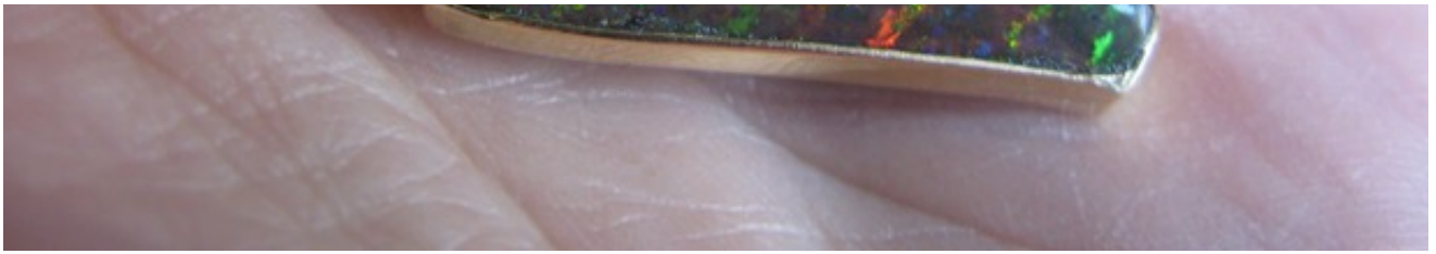
1. $2,500 IMG_5110 Andamooka Super Gem Matrix Opal 21.55cts 33mm x 20mm at widest point set in 18k gold