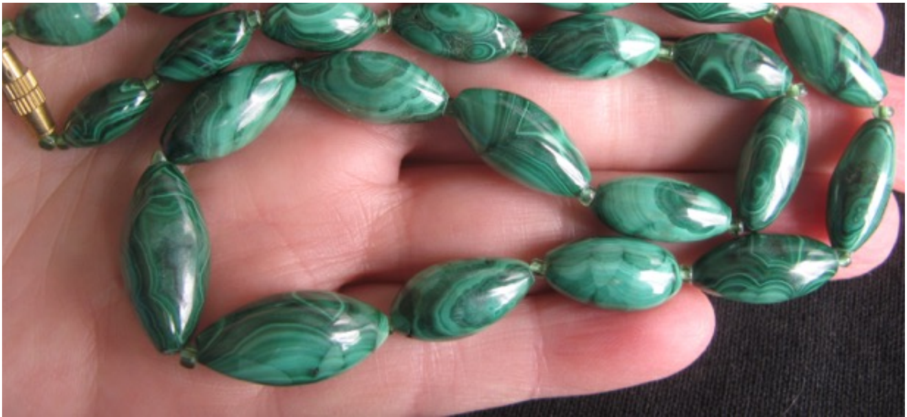
11. $315 IMG_4099 Malachite barrel beads strung with spacers, very pretty in nice box 17" long, think gold screw clasp in nice box 235cts