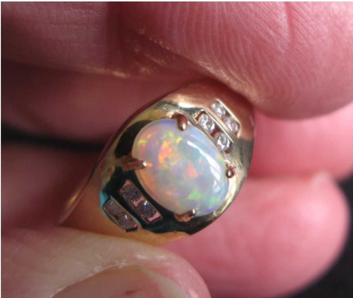
10. $560 IMG_3843 Opal Ring brilliant set in broad 18k gold with 8 small diamonds, 8mm x 6mm