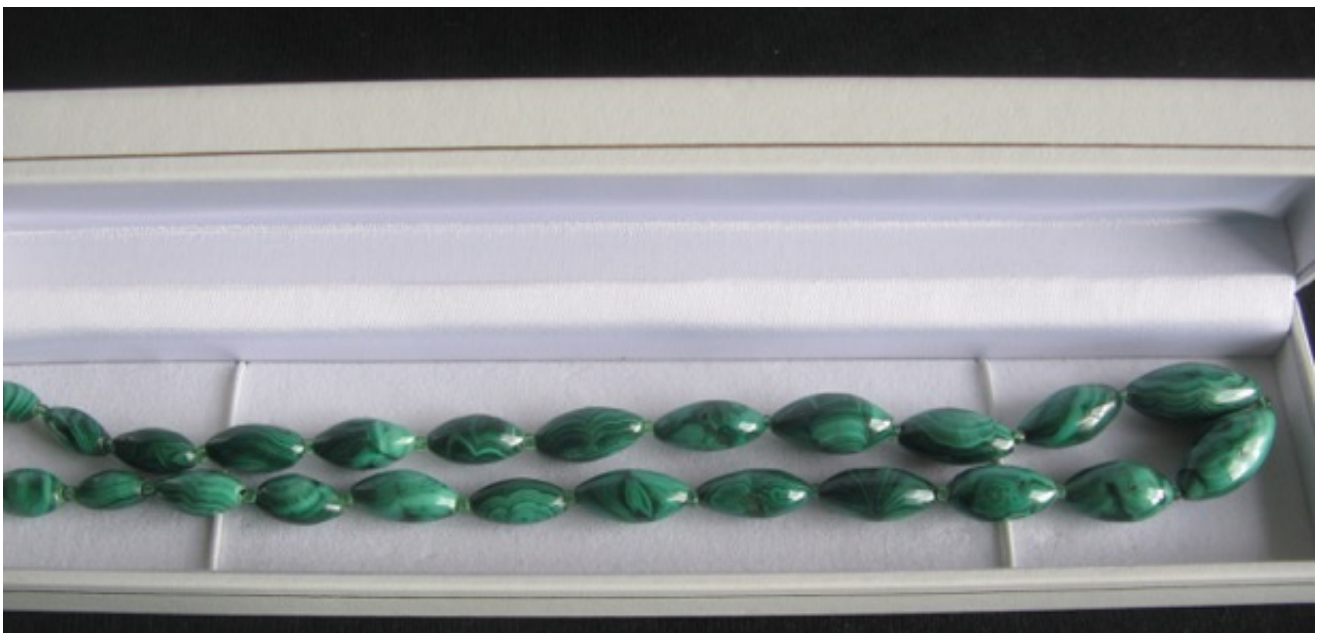
12. $315 IMG_4105 Malachite barrel beads strung with spacers, very pretty in nice box 17" long, think gold screw clasp in nice box 235cts