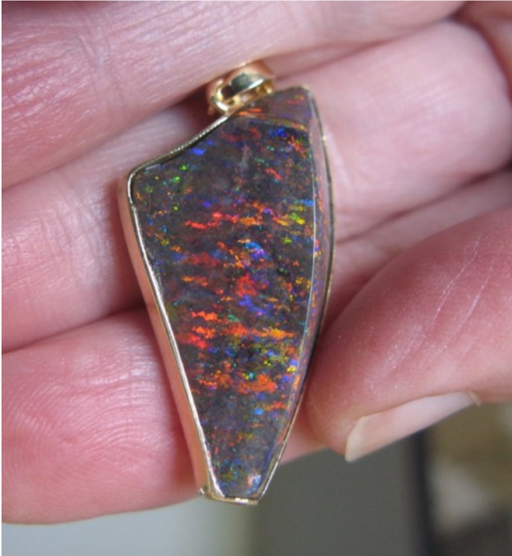
5. $2,500 IMG_5234 Andamooka Super Gem Matrix Opal 21.55cts 33mm x 20mm at widest point set in 18k gold