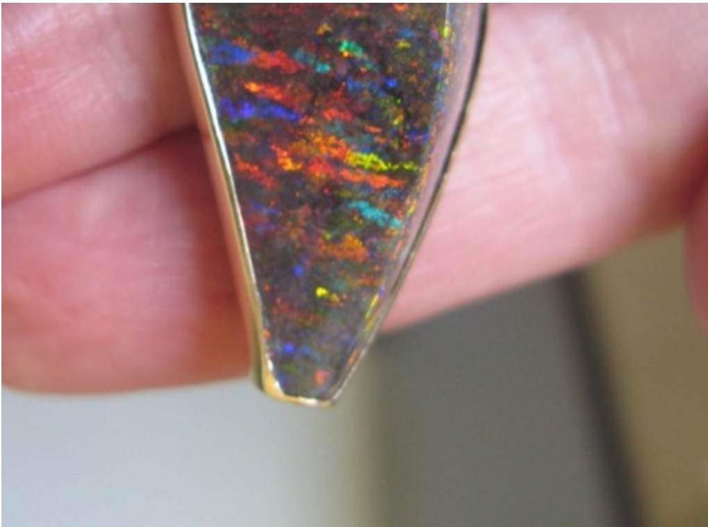
6. $2,500 IMG_5239 Andamooka Super Gem Matrix Opal 21.55cts 33mm x 20mm at widest point set in 18k gold