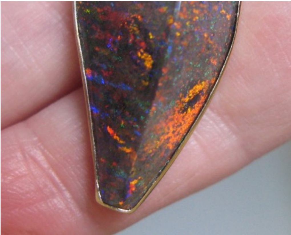
3. $2,500 IMG_5232 Andamooka Super Gem Matrix Opal 21.55cts 33mm x 20mm at widest point set in 18k gold