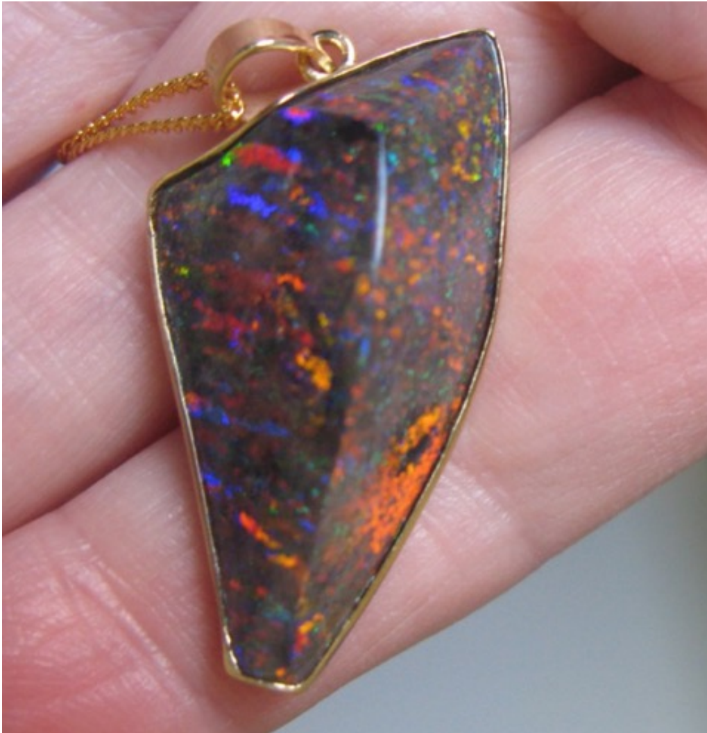
2. $2,500 IMG_5231 Andamooka Super Gem Matrix Opal 21.55cts 33mm x 20mm at widest point set in 18k gold