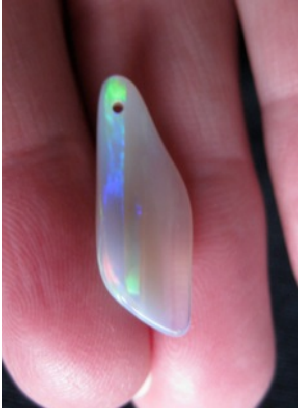
5. SOLD IMG_0904.JPG Coober Pedy Gem Shell Opalised Pendant drilled 4.47cts (front)