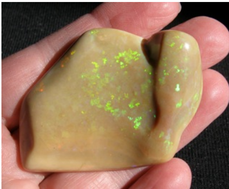
1. $245 IMG_7856 Andamooka Natural Honey Matrix 133.9cts - make a magnificent pendant