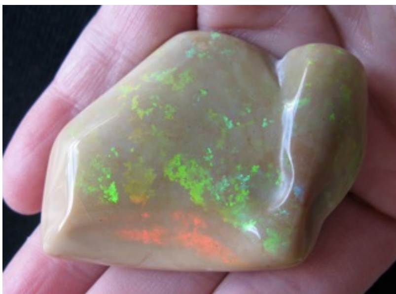
2. $245 IMG_7860 Andamooka Natural Honey Matrix 133.9cts - make a magnificent pendant