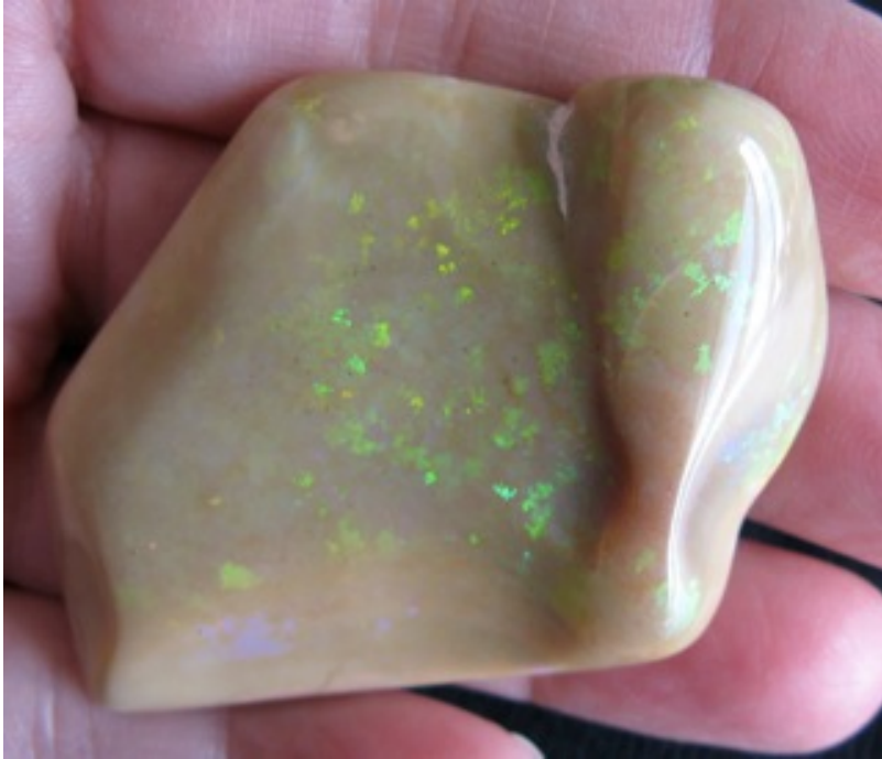
3. $245 IMG_7865 Andamooka Natural Honey Matrix 133.9cts - make a magnificent pendant