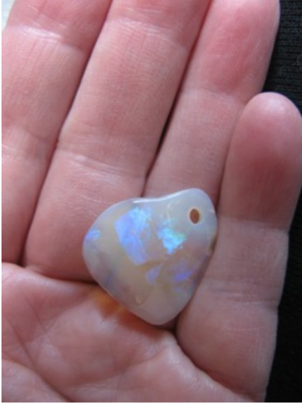
11. SOLD IMG_7873 Shell Opalised "skinny" blue green Pendant 7.64cts hole drilled