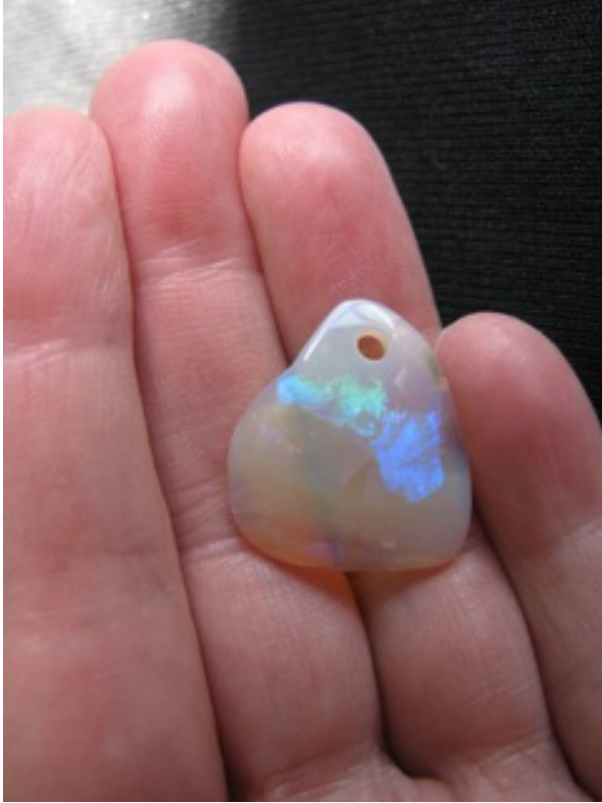
8. SOLD IMG_7870 Shell Opalised "skinny" blue green Pendant 7.64cts hole drilled