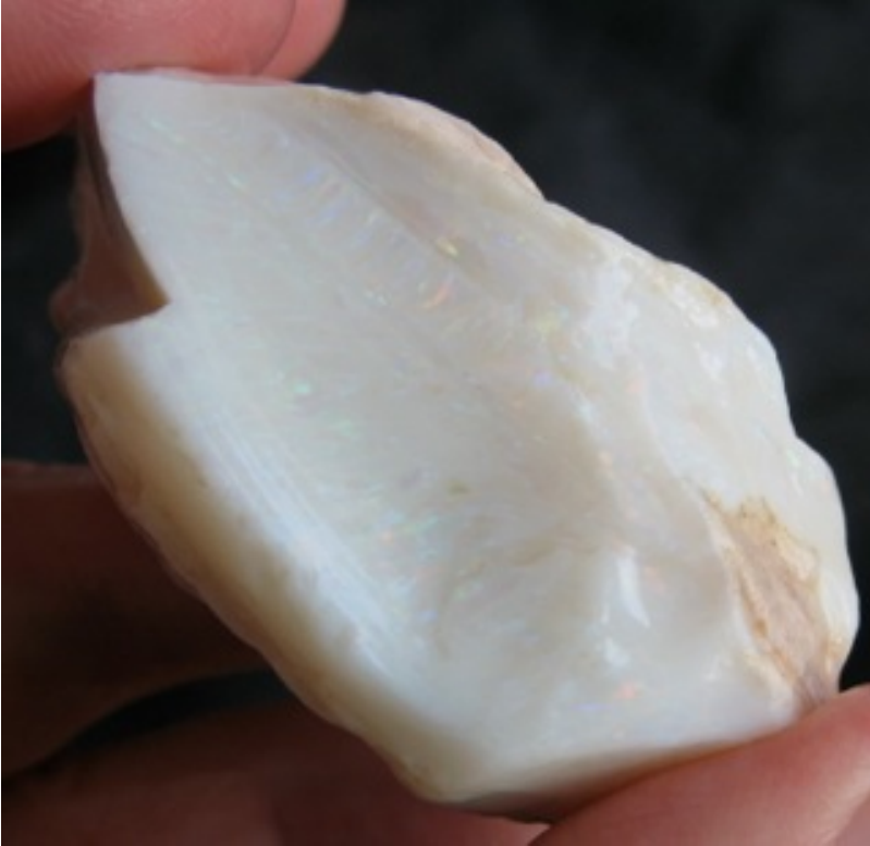
17. $696 IMG_8073 Coober Pedy Reds Golds Greens pinfire 65mm x 33mm x 25mm thick $350/oz 1.99oz