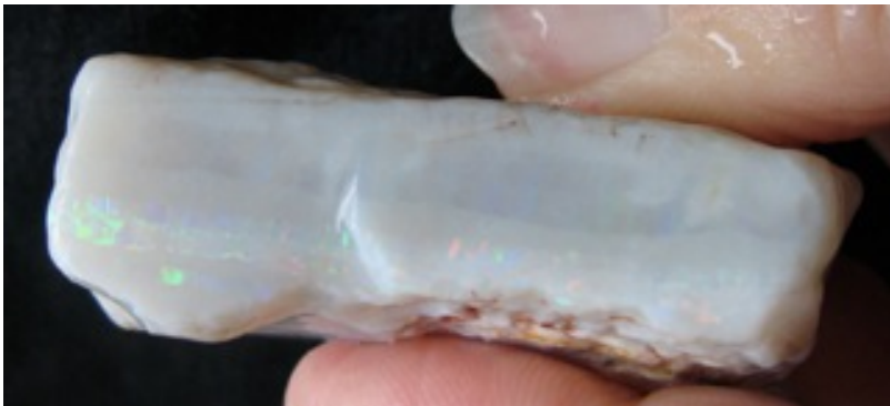
8. $459 IMG_8132 Coober Pedy Dark Base Reds & Greens 48mm x 35mm x 12.5mm thick $275/oz 1.67oz