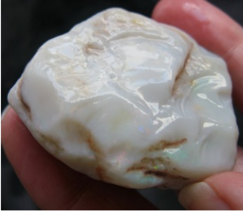
2. $78 IMG_8058 Coober Pedy 45mm x 35mm x 12mm thick $75/oz 1.04oz