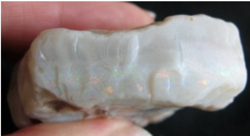
7. $459 IMG_8129 Coober Pedy Dark Base Reds & Greens 48mm x 35mm x 12.5mm thick $275/oz 1.67oz