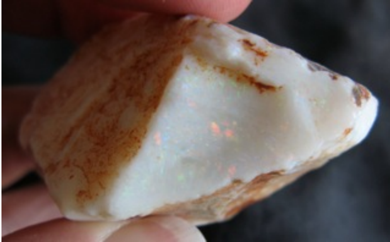
9. $609 IMG_8050 Coober Pedy Reds Golds Greens 'skin to skin' 45mm x 25mm x 25mm thick $350/oz 1.74oz