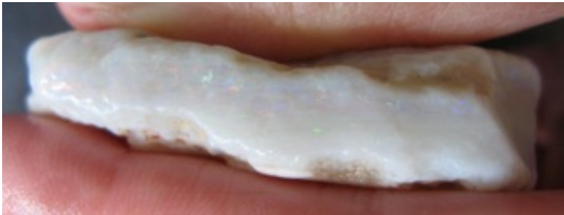
3. $312 IMG_8035 Coober Pedy Reds & Greens triangular 50mm x 50mm x 45mm & 10mm thick $300/oz 1.04oz