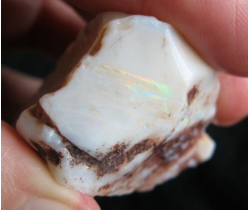
11. $612 IMG_8083 Coober Pedy Reds & Greens 55mm x 37mm x 25mm thick - a beauty lovely colours (hard to photograph) 2.04oz