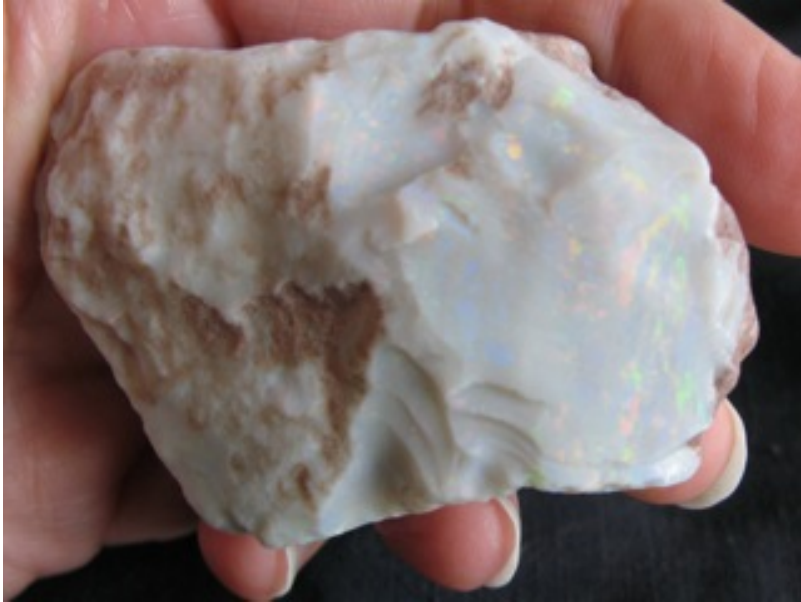
19. $731 IMG_8104 Coober Pedy Dark Base jumping flashing red fire 55mm x 40mm x 15mm thick $350/oz 2.09oz