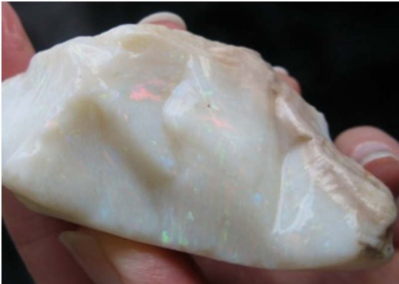
14. $696 IMG_8065 Coober Pedy Reds Golds Greens pinfire 65mm x 33mm x 25mm thick $350/oz 1.99oz