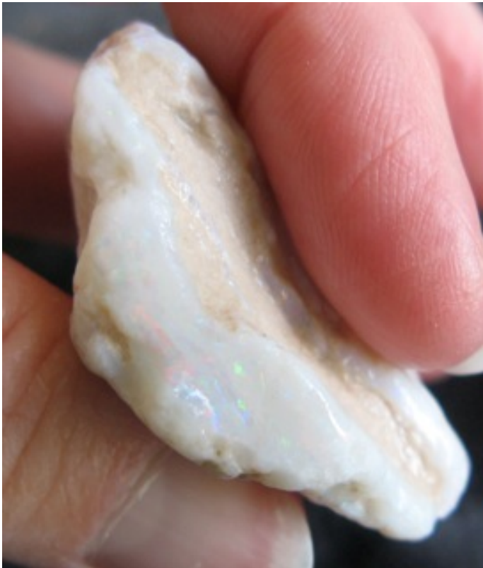
5. $312 IMG_8044 Coober Pedy Reds & Greens triangular 50mm x 50mm x 45mm & 10mm thick $300/oz 1.04oz