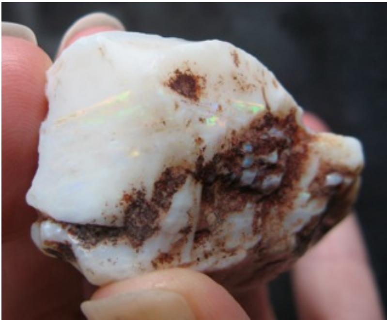
12. $612 IMG_8086 Coober Pedy Reds & Greens 55mm x 37mm x 25mm thick - a beauty lovely colours (hard to photograph) 2.04oz