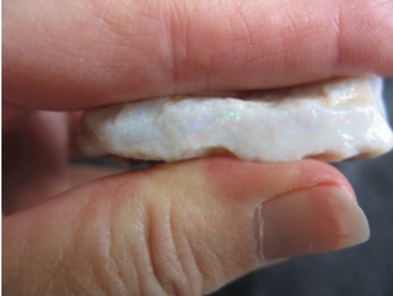
4. $312 IMG_8038 Coober Pedy Reds & Greens triangular 50mm x 50mm x 45mm & 10mm thick $300/oz 1.04oz