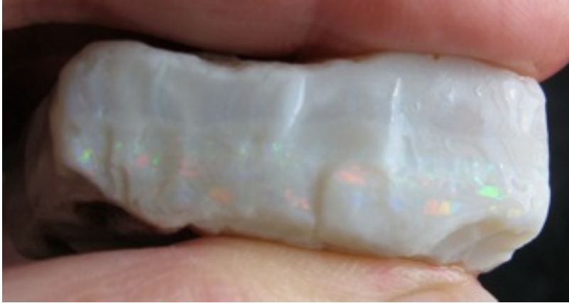
6. $459 IMG_8122 Coober Pedy Dark Base Reds & Greens 48mm x 35mm x 12.5mm thick $275/oz 1.67oz