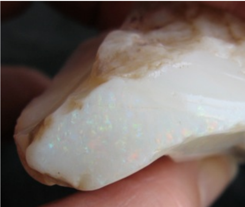
18. $696 IMG_8076 Coober Pedy Reds Golds Greens pinfire 65mm x 33mm x 25mm thick $350/oz 1.99oz