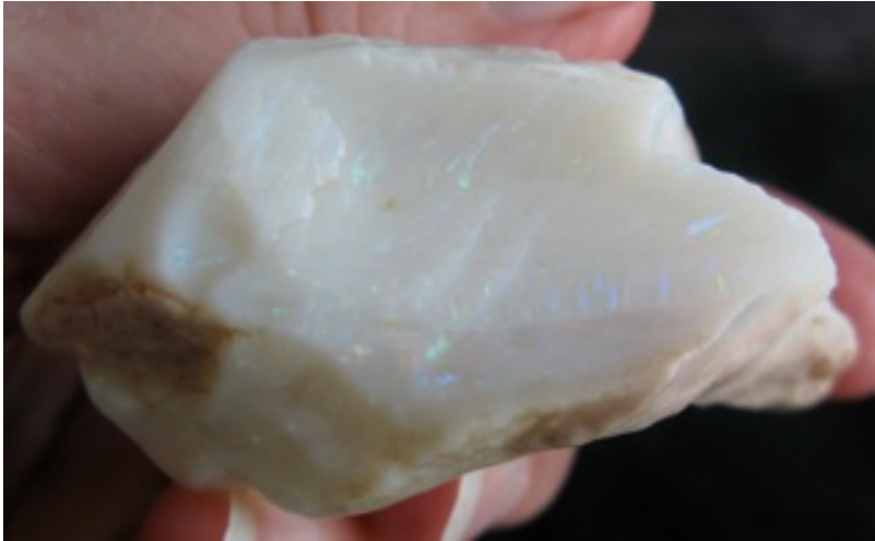
16. $696 IMG_8071 Coober Pedy Reds Golds Greens pinfire 65mm x 33mm x 25mm thick $350/oz 1.99oz