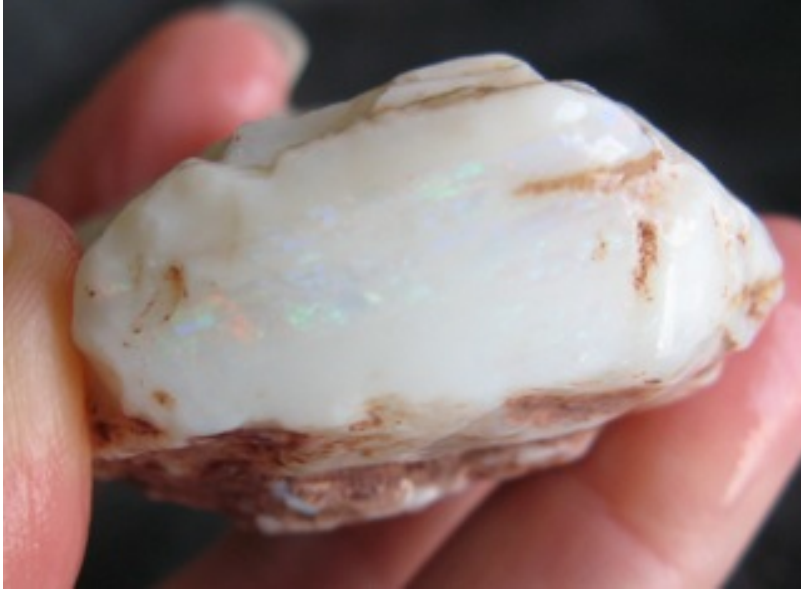
13. $612 IMG_8088 Coober Pedy Reds & Greens 55mm x 37mm x 25mm thick - a beauty lovely colours (hard to photograph) 2.04oz