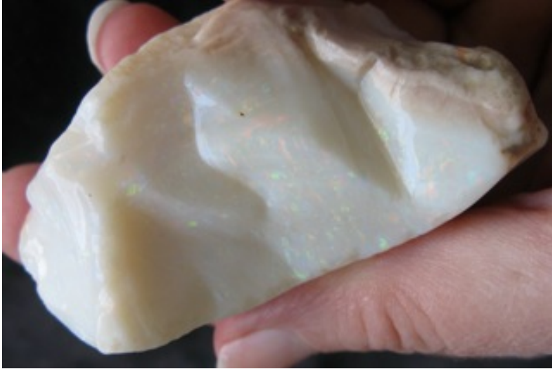
15. $696 IMG_8070 Coober Pedy Reds Golds Greens pinfire 65mm x 33mm x 25mm thick $350/oz 1.99oz