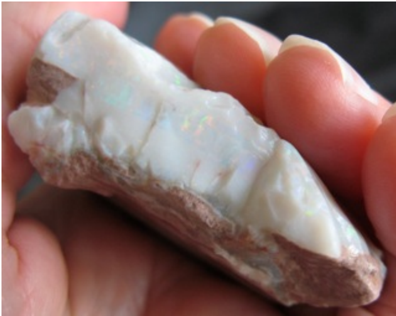
20. $731 IMG_8108 Coober Pedy Dark Base jumping flashing red fire 55mm x 40mm x 15mm thick $350/oz 2.09oz