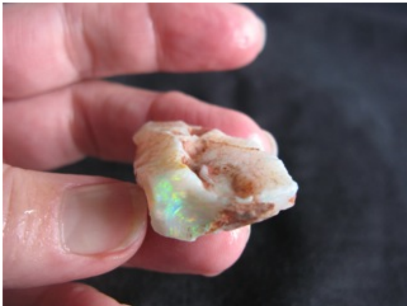
20. $520 IMG_1181 Olympic Gem $2,000/oz .26oz