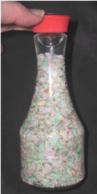
19. $400/oz DSCN4915.JPG Mintubi Gem Crystal Chips MCh1 5.55oz