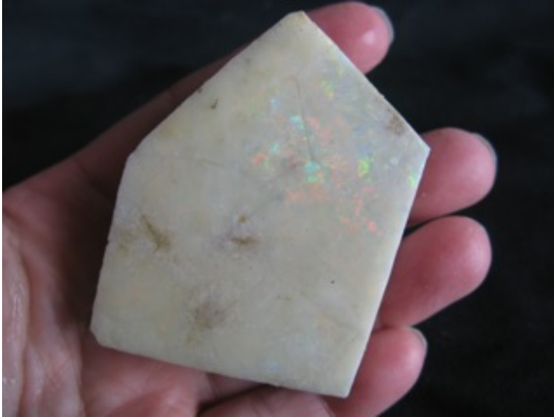
4. $97 IMG_1184 Mintubi faced specimen 2.25" x 1.5" x .75" thick 3oz