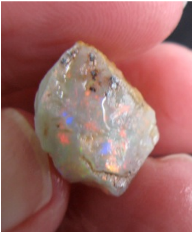
23. $719 IMG_9423 Olympic Super Gem 2.48 grams - would make one outstanding freeform ring