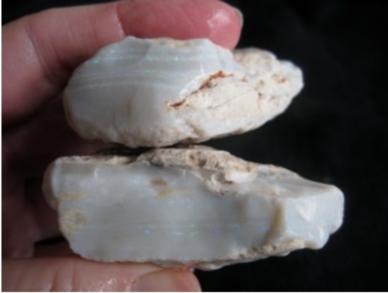
8. $119 IMG_2547 Special Olympic $35/oz 3.4oz