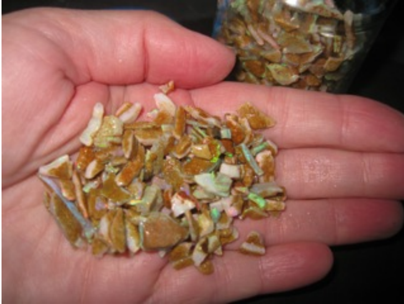
12. $180 IMG_3105 Coober Pedy Chips $40/oz 4.5oz