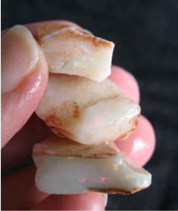
18. $280 IMG_1199 Olympic Reds & Greens $800/oz .35oz