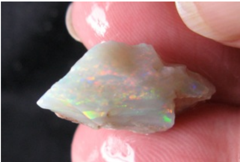
15. $210 IMG_1193 Olympic Super Gem .0715oz