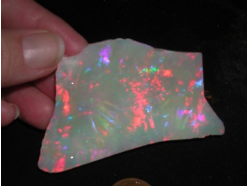
28. $8,000 DSCN3693_2 Olympic 1.49oz 74mm long x 40mm wide x 15mm thick down to 4mm thick on other side