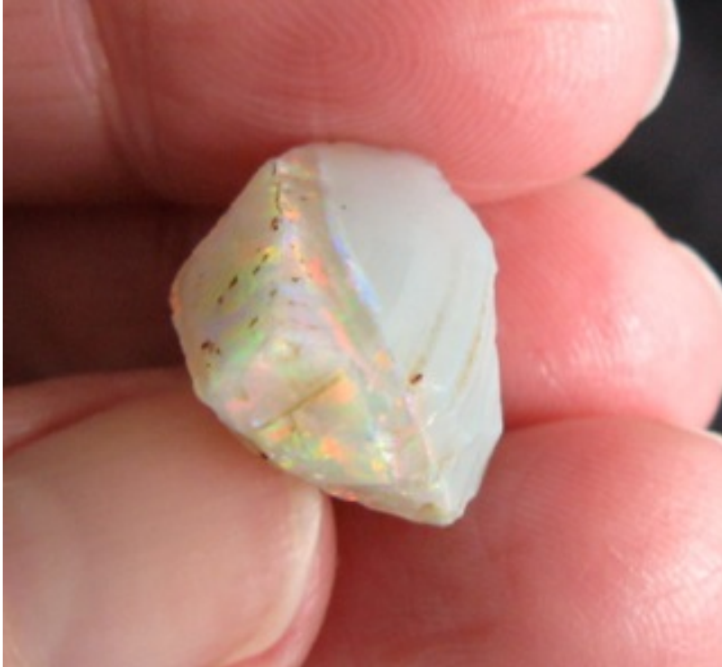
24. $719 IMG_9432 Olympic Super Gem 2.48 grams - would make one outstanding freeform ring