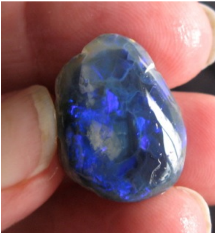
5. $98 IMG_1177 Lightning Ridge Nobbie brilliant Blues 20.55cts