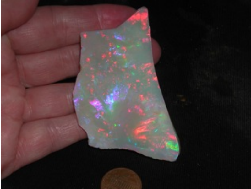
30. $8,000 DSCN3695-2 Olympic 1.49oz 74mm long x 40mm wide x 15mm thick down to 4mm thick on other side