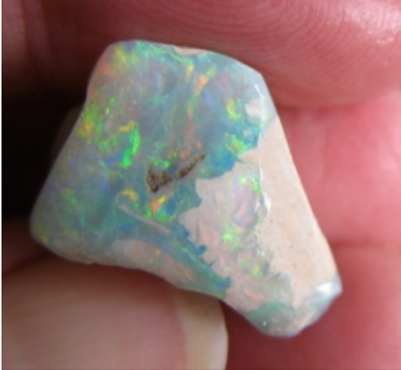
6. $99 IMG_1204 Lightning Ridge Nobbie brilliant Reds & Greens 12.2cts