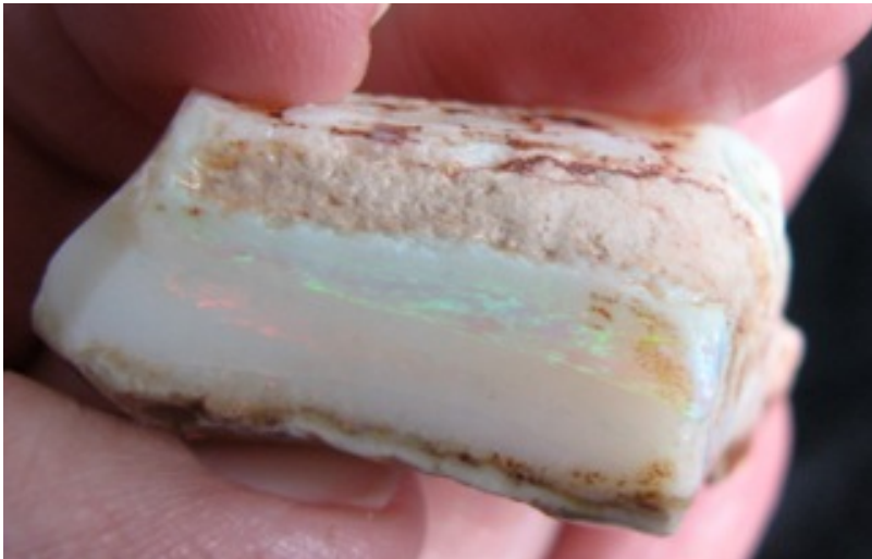
17. $276 IMG_9413 Olympic $300/oz .92oz - a great stone