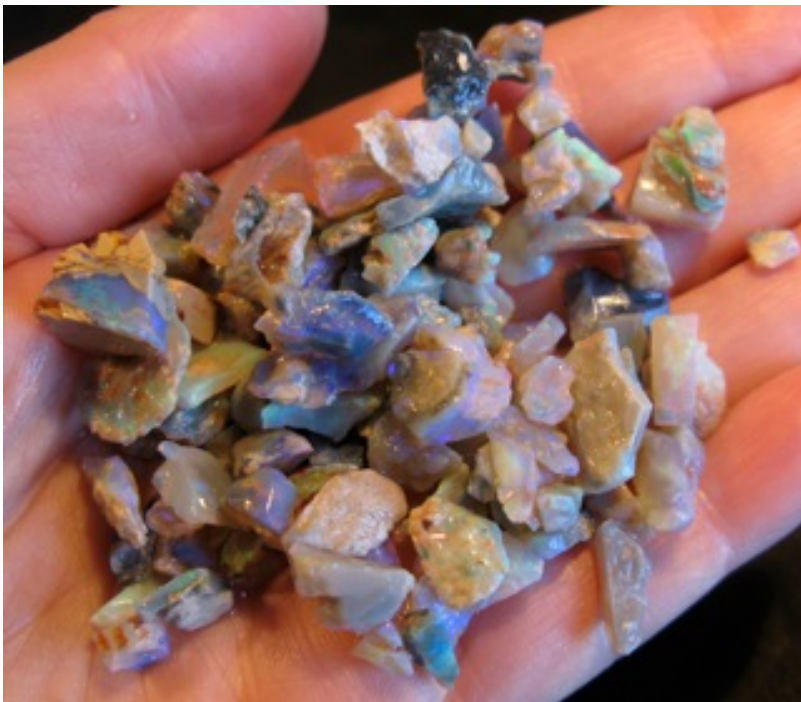
9. $125 IMG_6299 Lightning Ridge very bright Chips