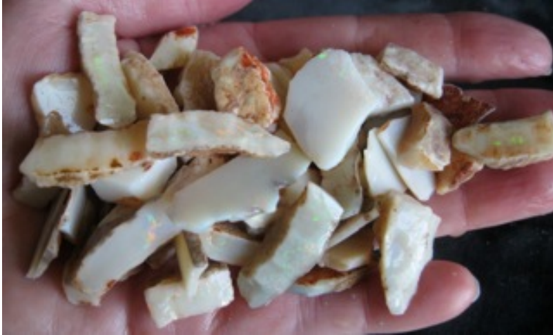
2. $65 IMG_3104 Coober Pedy small stones $25/oz 2.6oz