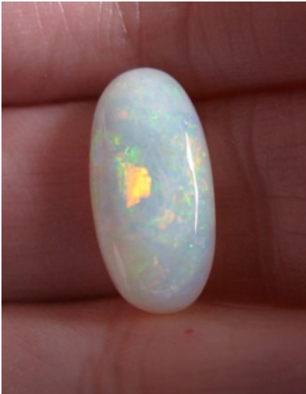
31. $180 was $247 IMG_1213 SPECIAL Andamooka Reds & Greens $60/ct 4.12cts