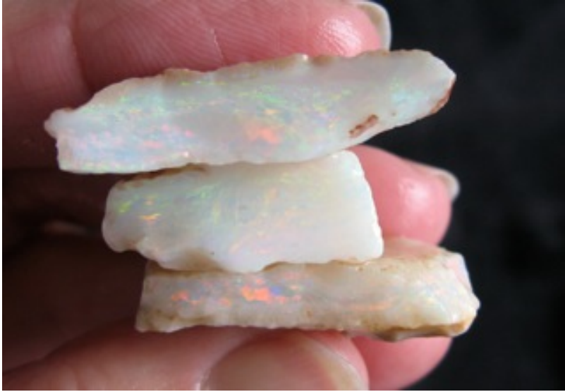
16. $236 IMG_1195 Olympic Reds & Greens great yield $800/oz .295oz