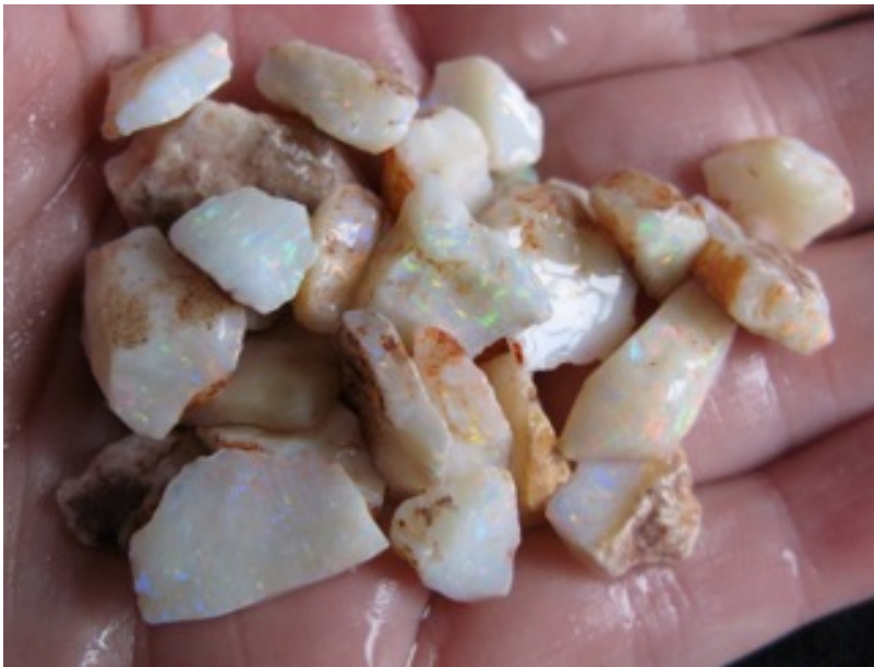
7. $118 IMG_9454 Olympic small bright stones .59oz - will make great little solids