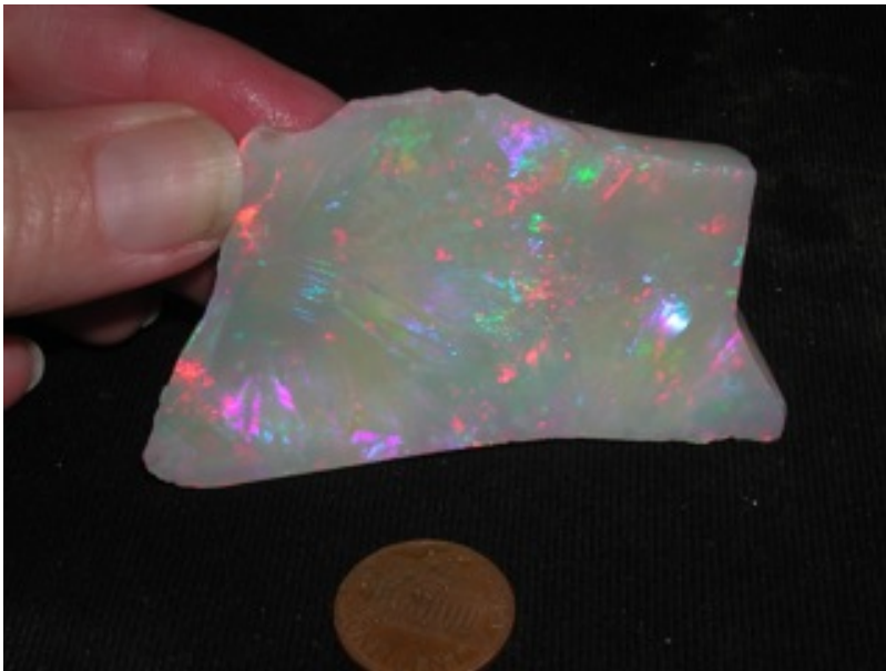
27. $8,000 DSCN3690_2 Olympic 1.49oz 74mm long x 40mm wide x 15mm thick down to 4mm thick on other side