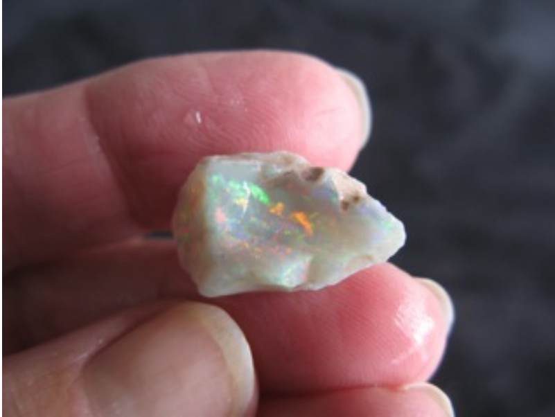
14. $210 IMG_1191 Olympic Super Gem .0715oz