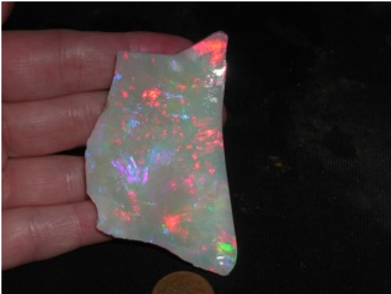
29. $8,000 DSCN3694_2 Olympic 1.49oz 74mm long x 40mm wide x 15mm thick down to 4mm thick on other side