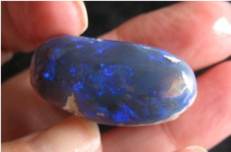
11. $172 IMG_1206 Lightning Ridge large Nobbie beautiful Blues to cut a 30mm x 14mm ring 60.9cts