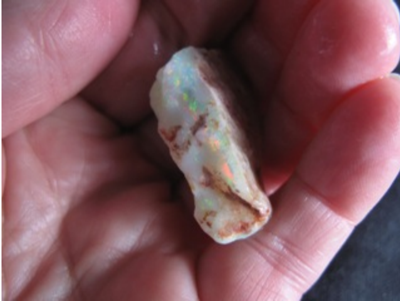
22. $520 IMG_1183 Olympic Gem $2,000/oz .26oz