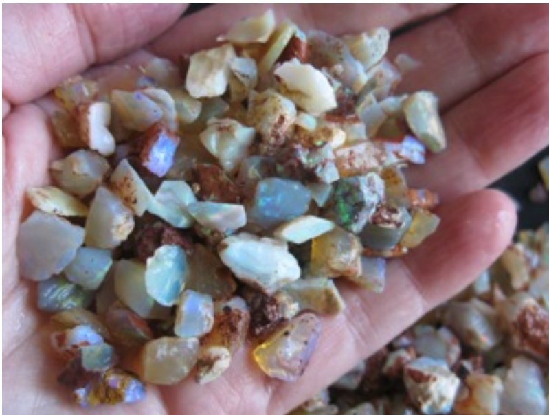
13. $200 IMG_5921 Lambina very bright Chips $50/oz 4oz