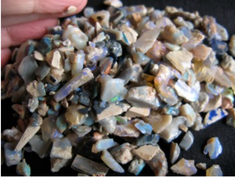
10. $125 IMG_1209 Lightning Ridge Chips $25/oz 5oz