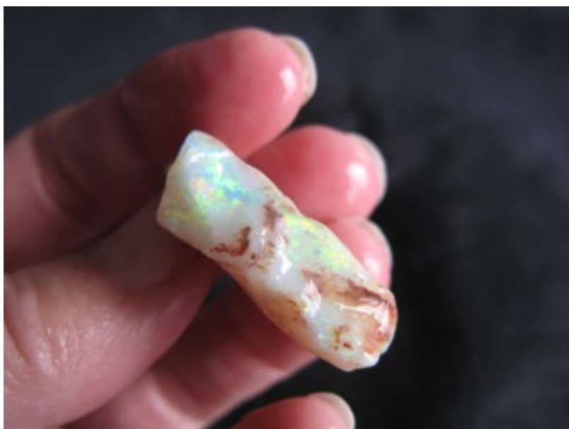
21. $520 IMG_1182 Olympic Gem $2,000/oz .26oz