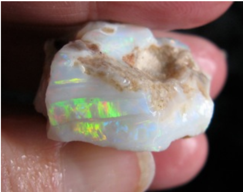
25. $720 IMG_1174 Shell Patch Reds & Greens $1,800/oz .4oz