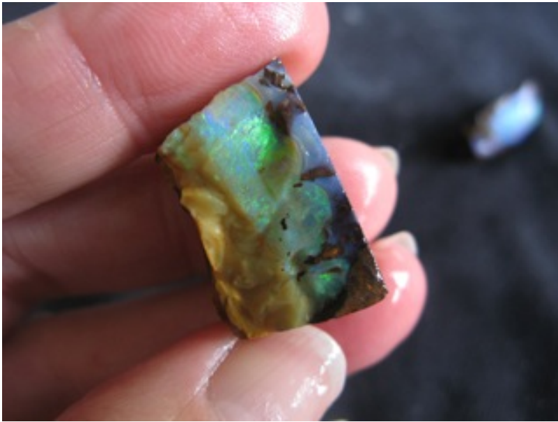
10. $100 IMG_2032 Boulder