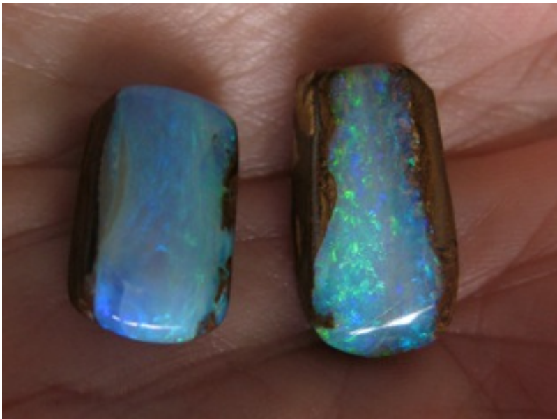
29. $600 IMG_1611 Boulder Pipe Opals (2) 18.97cts $300 each - one has a natural flaw