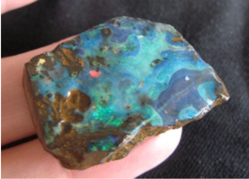
9. $85 IMG_1505 Boulder Opal .415oz