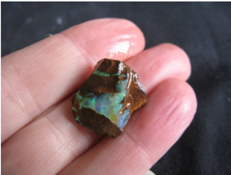
2. $25 IMG_2024 Boulder Gem .798oz