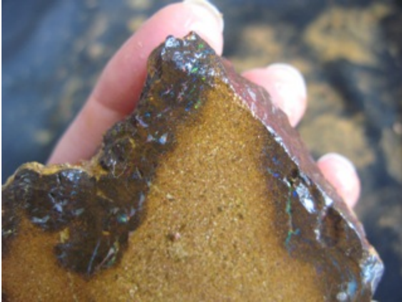
24. $345 IMG_0482 Boulder Matrix Opal 5.8oz