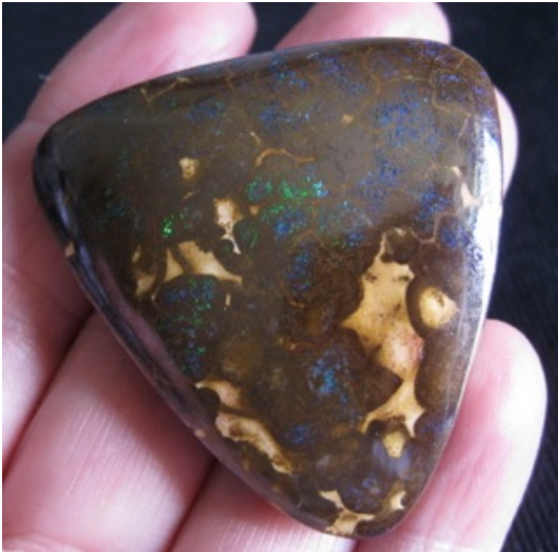
8. $75 IMG_9520 Boulder Matrix Opal 46mm x 46mm 201cts 1.29oz