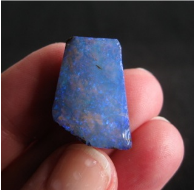
19. $225 IMG_0846 Boulder Opal Blues 26.8cts 23mm x 15mm