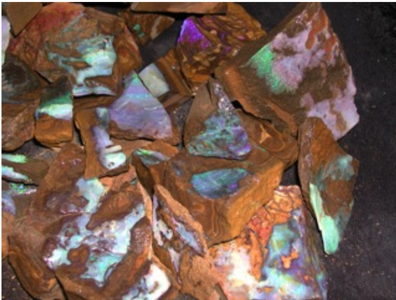
15. $200 DSCN2567 Boulder Winton (small pieces) .5 kilo remaining