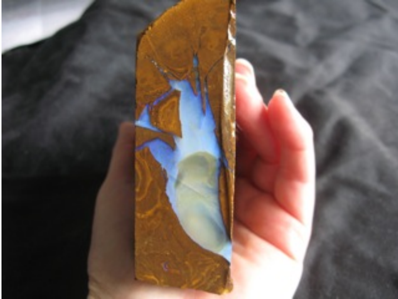
22. $275 IMG_5798 Boulder 20.25oz 3.5" x 4" x 1.25" thick