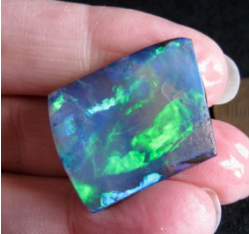
30. $1,250 IMG_0588 Boulder Green Blue Gem Faced approx 25x22mm .237oz