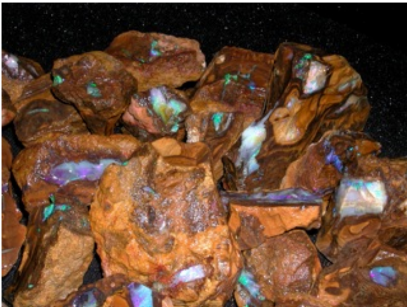
23. $300 DSCN8713 Boulder Pipe Opal 1 kilo