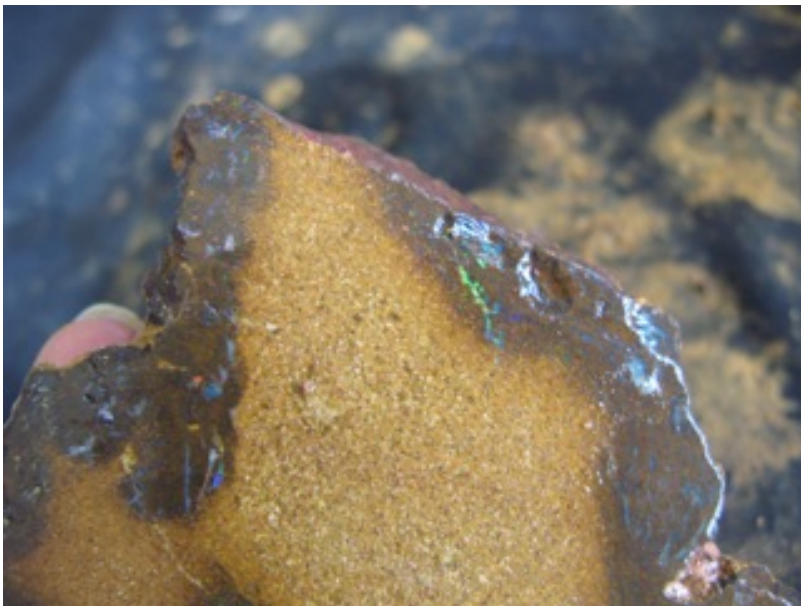
25. $345 IMG_0485 Boulder Matrix Opal 5.8oz