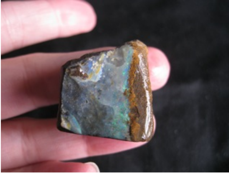
1. $10 IMG_6876 Boulder