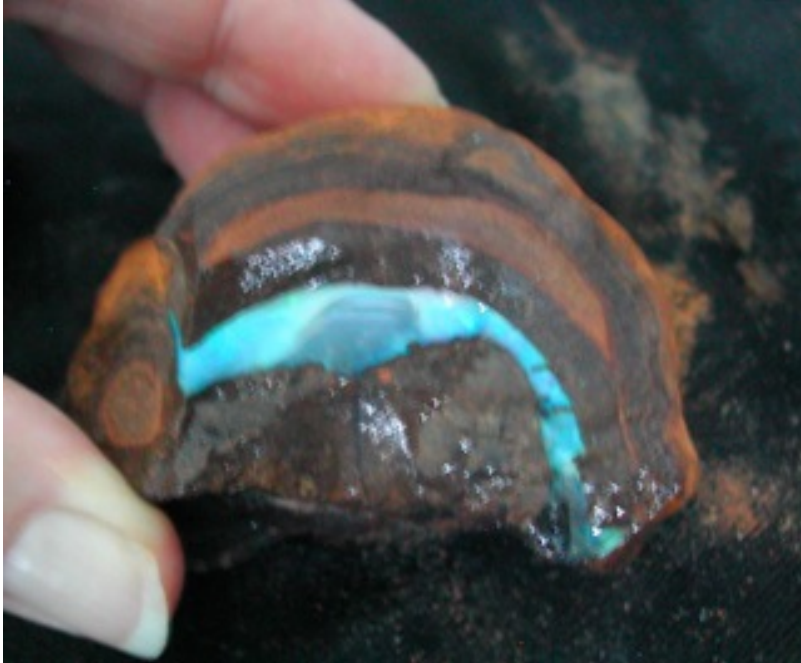
7. $70 DSCN0148 Boulder Opal Gem Greens 3.4oz