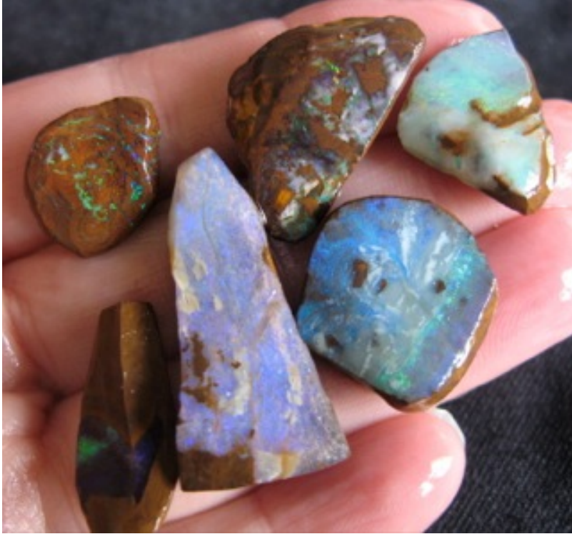
18. $250 the lot IMG_2035 Boulders (6)