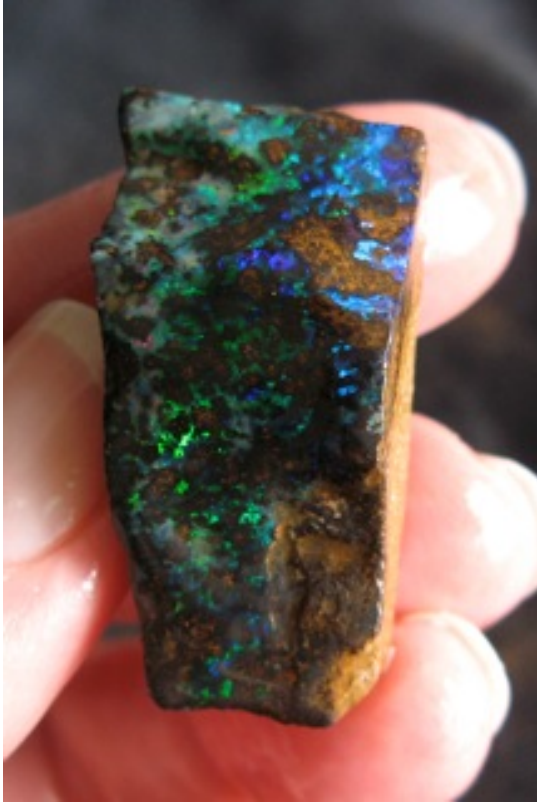
20. $225 IMG_4811 Boulder .352oz