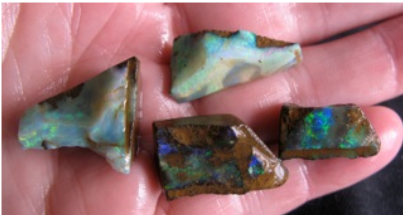
12. $100 the lot IMG_1616 Boulder Opals (4) .397oz