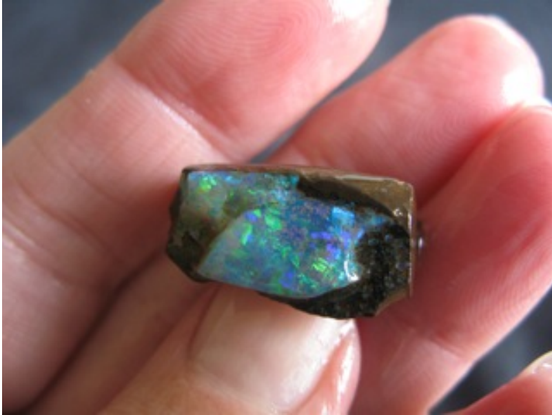
11. $100 IMG_2034 Boulder