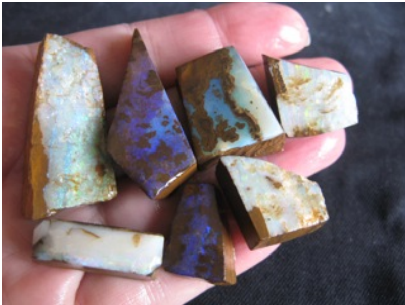
17. $200 the lot IMG_2038 Boulders (7)