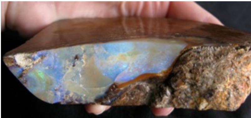
13. $125 IMG_1001 Boulder 340 grams