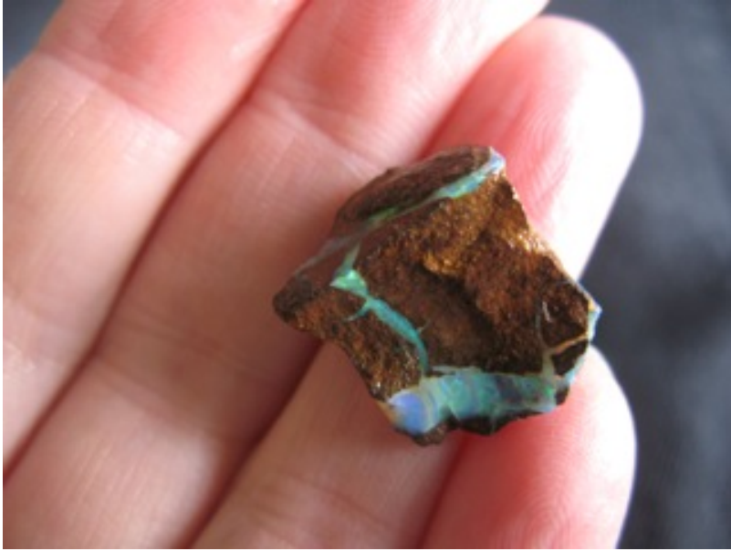
3. $25 IMG_2026 Boulder Gem .798oz