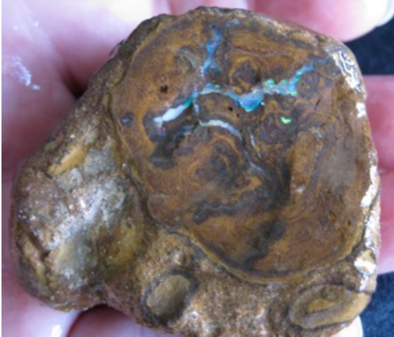
14. $125 IMG_7618 Boulder gem bars 3.25oz