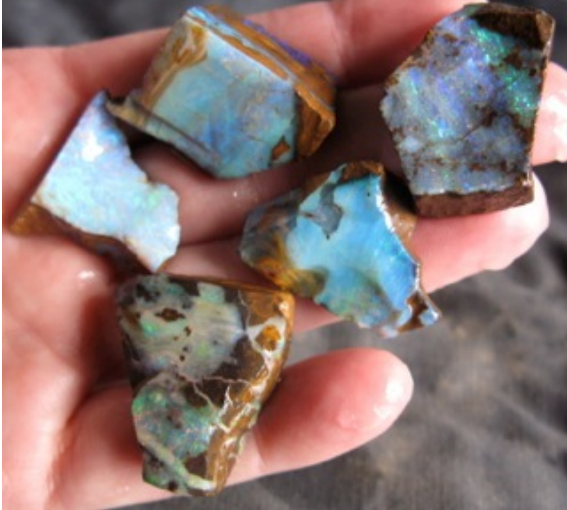
5. $25 each IMG_6759 Boulder Opals (5) $125