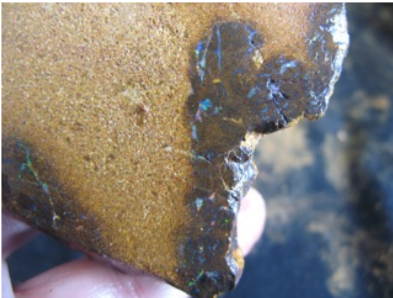
27. $345 IMG_0487 Boulder Matrix Opal 5.8oz