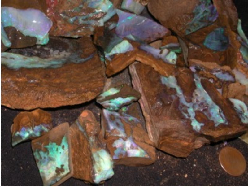
16. $200 DSCN2568 Boulder Winton (small pieces) .5 kilo remaining