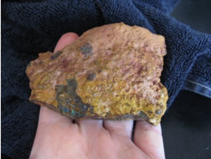
28. $345 IMG_0490 Boulder Matrix Opal 5.8oz