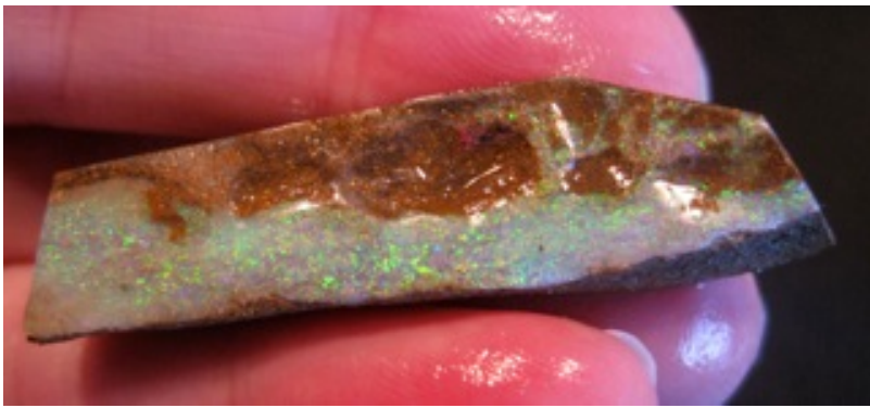
4. $27 IMG_3341 Boulder .24oz