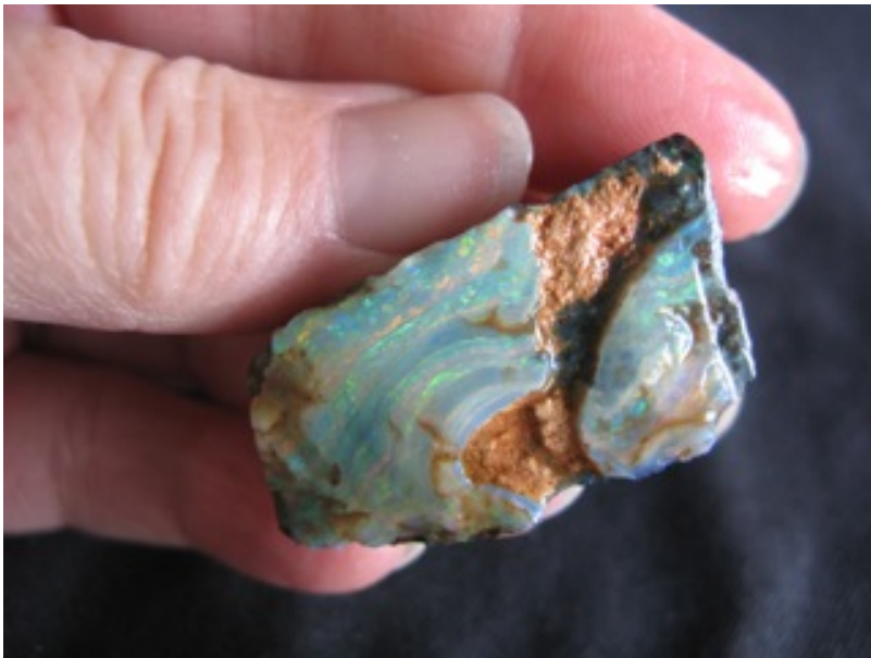
6. $40 IMG_2027 Boulder Opal