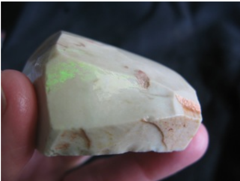
26. $1,255 IMG_1414 Andamooka untreated Matrix $500/oz 2.51oz