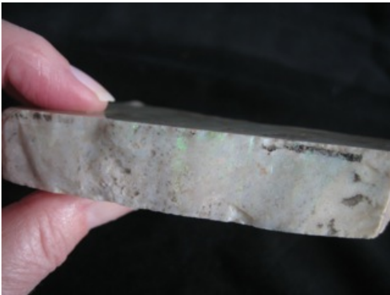
24. $1,020 IMG_6546 Matrix untreated 3.5"x1.5"x.75" thick $200/oz 5.1oz