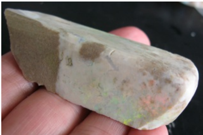
1. $45 IMG_1079 Andamooka Matrix Opal 1oz

25-26. $1,255 IMG_1411 Andamooka untreated Matrix $500/oz 2.51oz