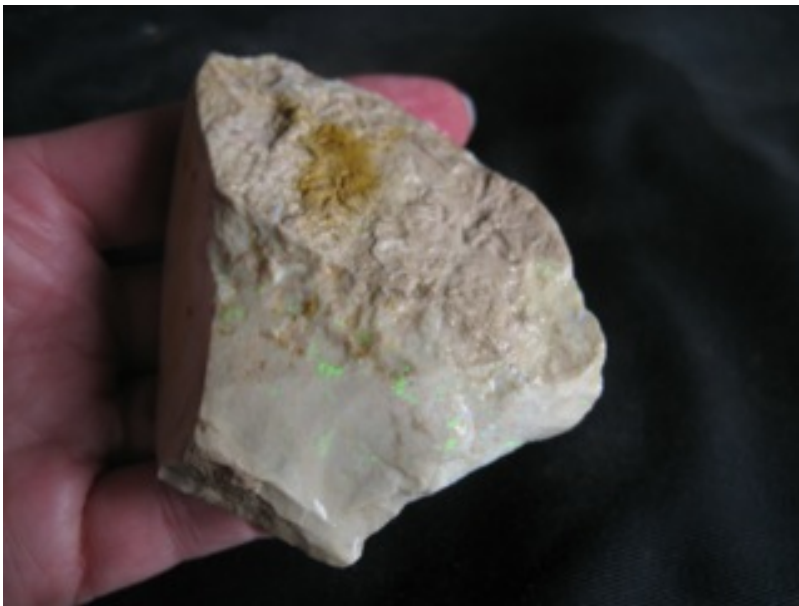
16. $770 IMG_6530 Matrix untreated 3"x2"x.5" thick $200/oz 3.85oz