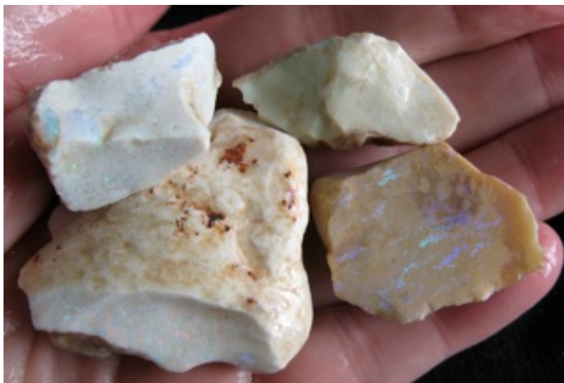
2. $51 IMG_1041 Andamooka Matrix untreated $30/oz 1.7oz