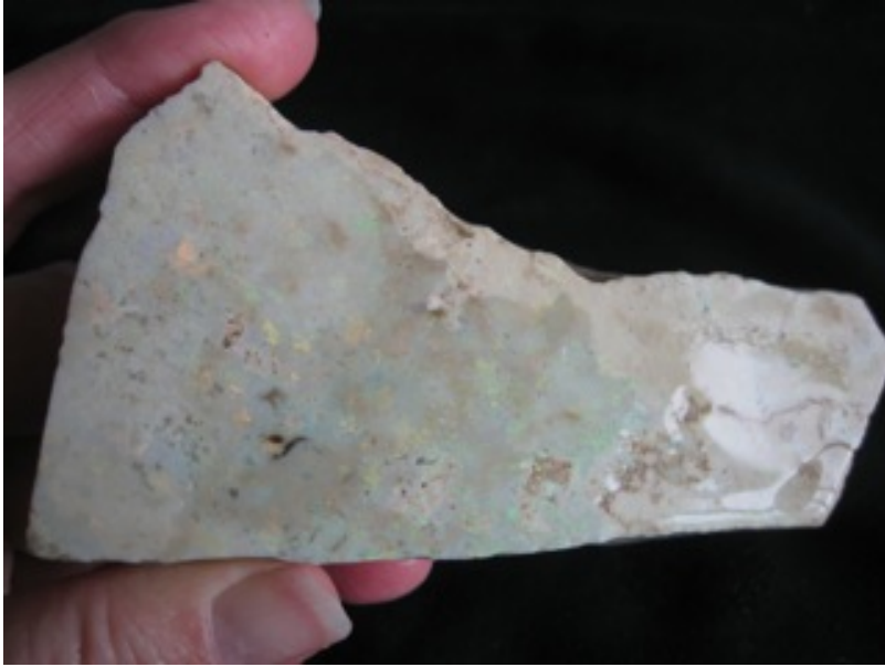
23. $1,020 IMG_6543 Matrix untreated 3.5"x1.5"x.75" thick $200/oz 5.1oz