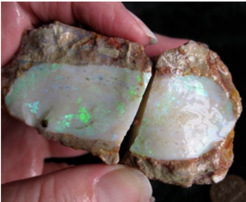
18. $800 IMG_1147.JPG Andamooka Matrix Gem stones in rock (2) 4.1oz