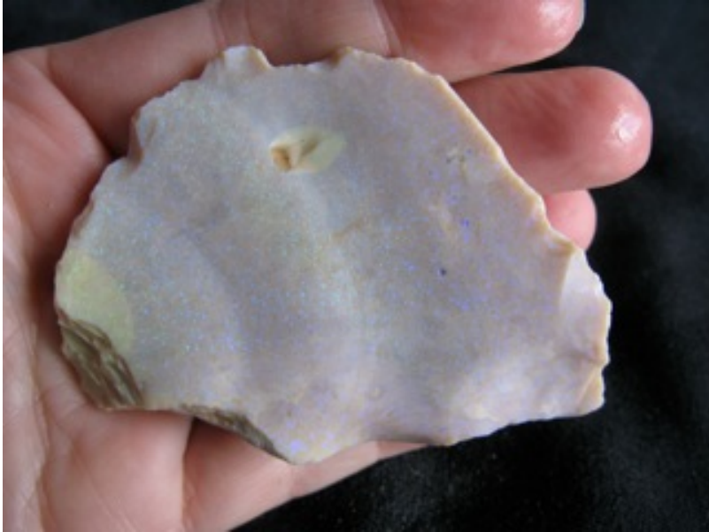
3. $56.40 IMG_1004 Andamooka Matrix untreated $30/oz 1.88oz