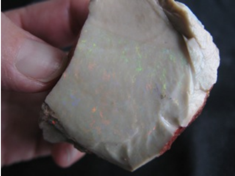
7. $590 IMG_1577 Andamooka Untreated Matrix Reds, Golds some Blues 50mm x 40mm x 22mm thick $200/oz 2.95oz