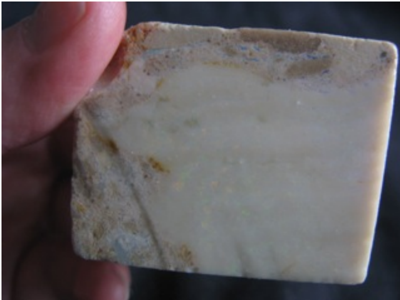
12. $710 IMG_1587 Andamooka Untreated Matrix Reds, Golds & Greens 48mm x 39mm x 35mm thick $200/oz 3.55oz