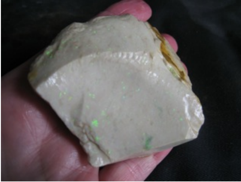
17. $770 IMG_6531 Matrix untreated 3"x2"x.5" thick $200/oz 3.85oz