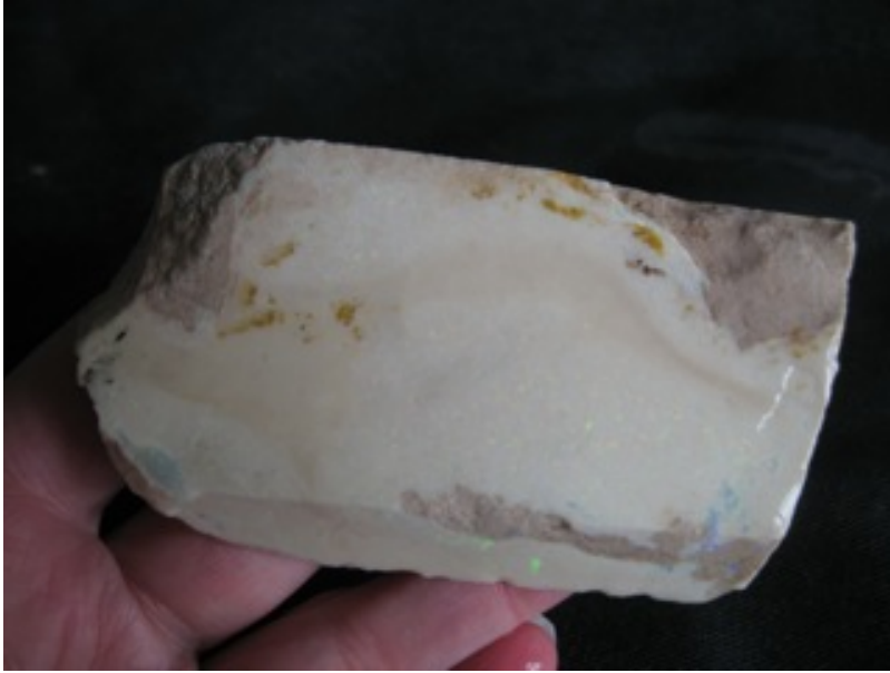
13. $750 IMG_6532 Matrix untreated 3"x2"x3/8" thick $300/oz 2.5oz