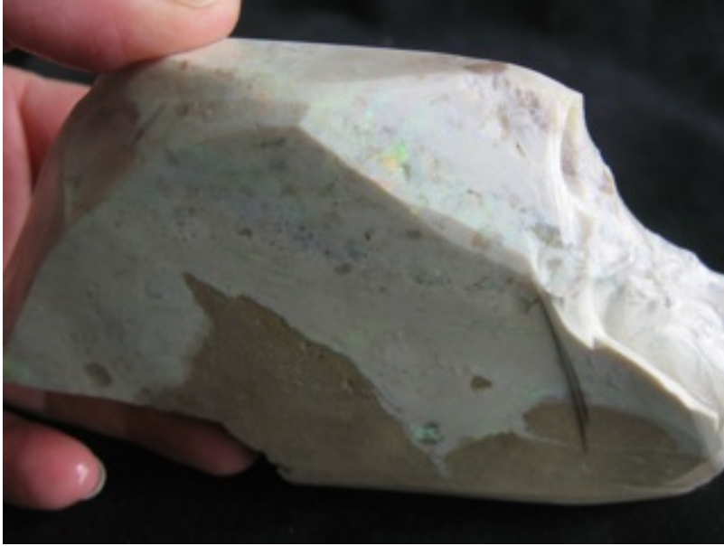
5. $175 IMG_1081 Andamooka Matrix Opal great colours 7.85oz