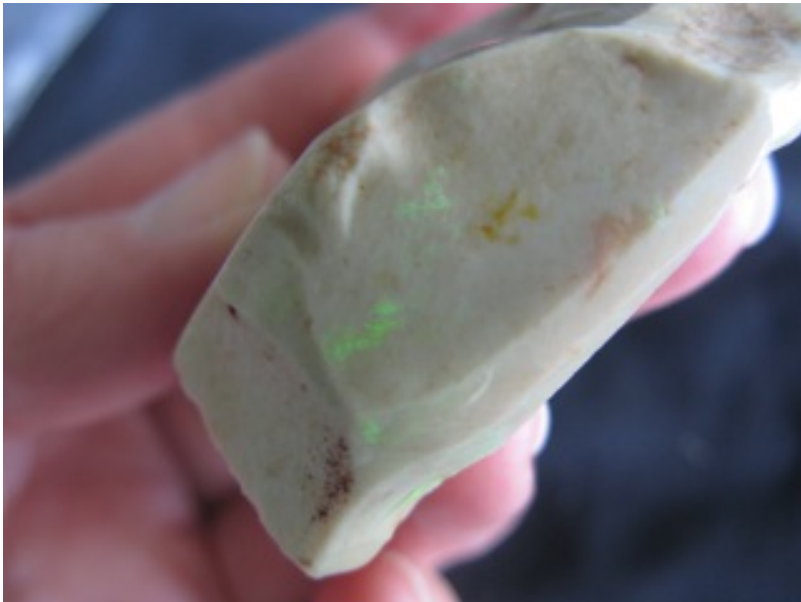
8. $680 IMG_1406 Andamooka untreated Matrix $500/oz 1.36oz