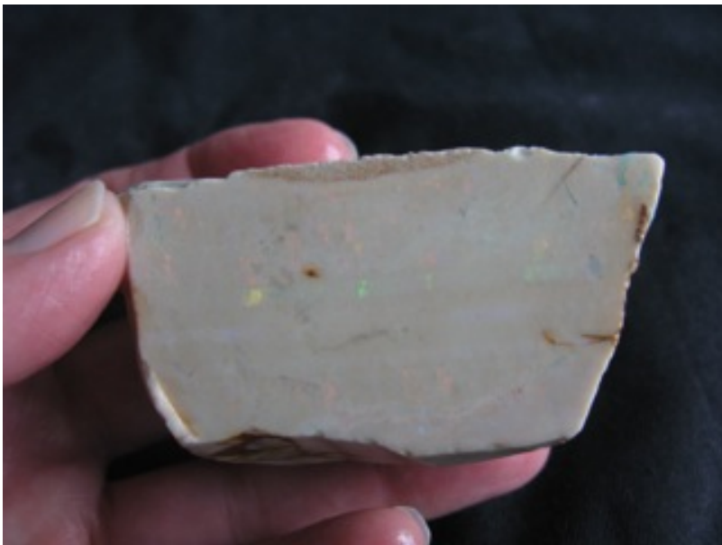
20. $820 IMG_1588 Andamooka Untreated Matrix Reds, Golds some Blues 60mm x 35mm x 30mm thick $200/oz 4.1oz