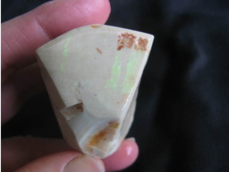
25. $1,255 IMG_1411 Andamooka untreated Matrix $500/oz 2.51oz