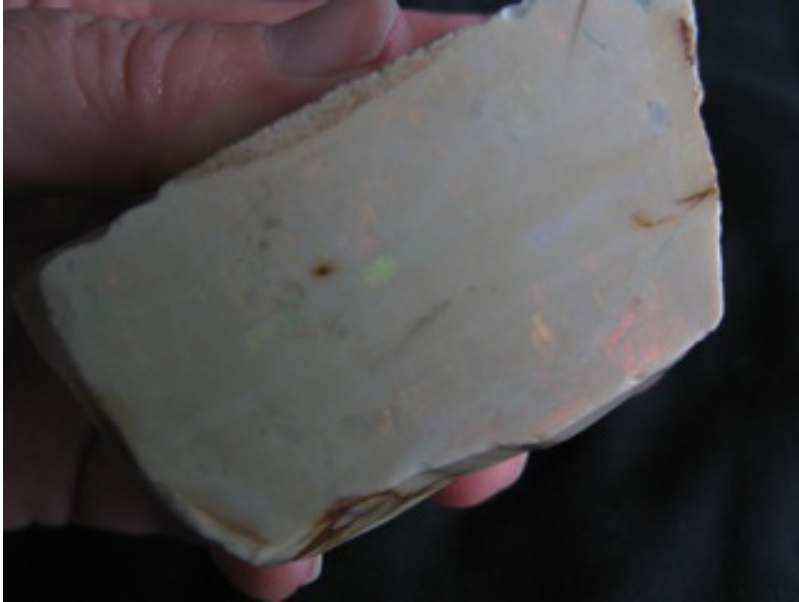
21. $820 IMG_1590 Andamooka Untreated Matrix Reds, Golds some Blues 60mm x 35mm x 30mm thick $200/oz 4.1oz