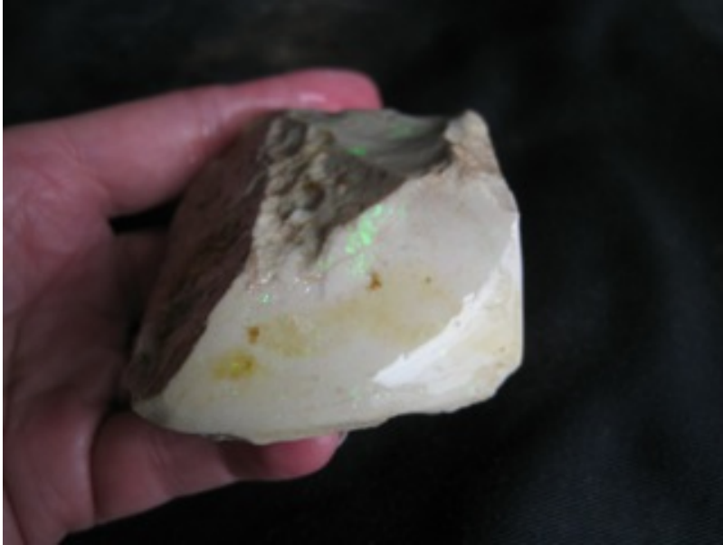
15. $770 IMG_6529 Matrix untreated 3"x2"x.5" thick $200/oz 3.85oz