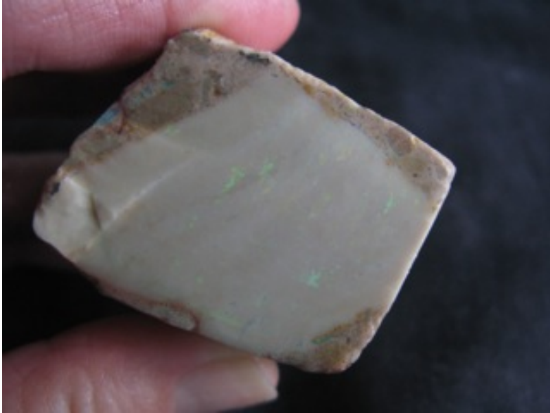
11. $710 IMG_1579 Andamooka Untreated Matrix Reds, Golds & Greens 48mm x 39mm x 35mm thick $200/oz 3.55oz