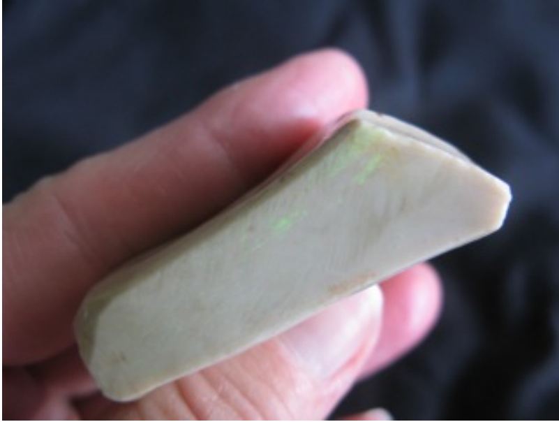
9. $680 IMG_1407 Andamooka untreated Matrix $500/oz 1.36oz