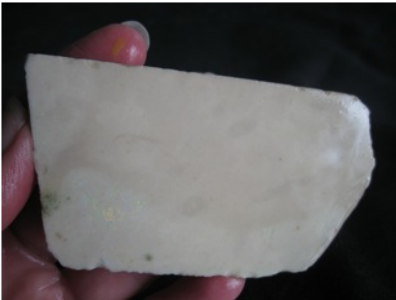
14. $750 IMG_6535 Matrix untreated 3"x2"x3/8" thick $300/oz 2.5oz