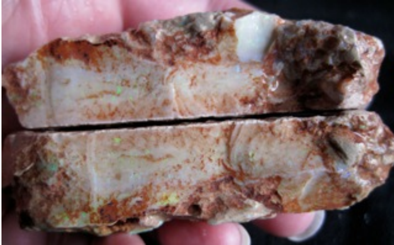
19. $800 IMG_1165.JPG Andamooka Matrix (pair) 3.58oz