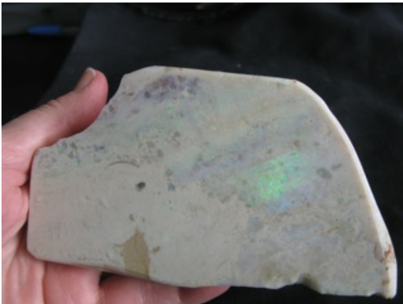
4. $175 IMG_1080 Andamooka Matrix Opal great colours 7.85oz