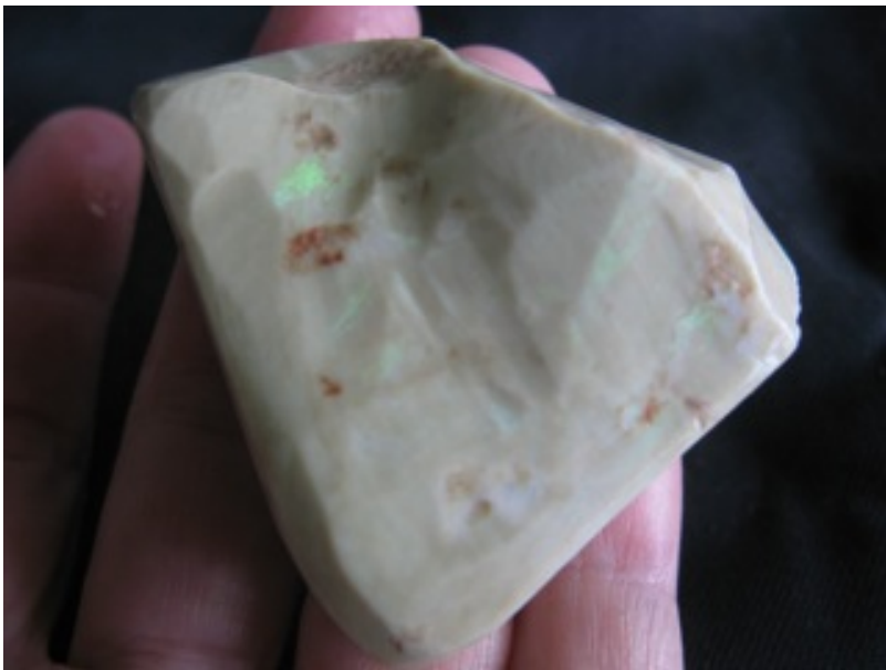
10. $680 IMG_1409 Andamooka untreated Matrix $500/oz 1.36oz