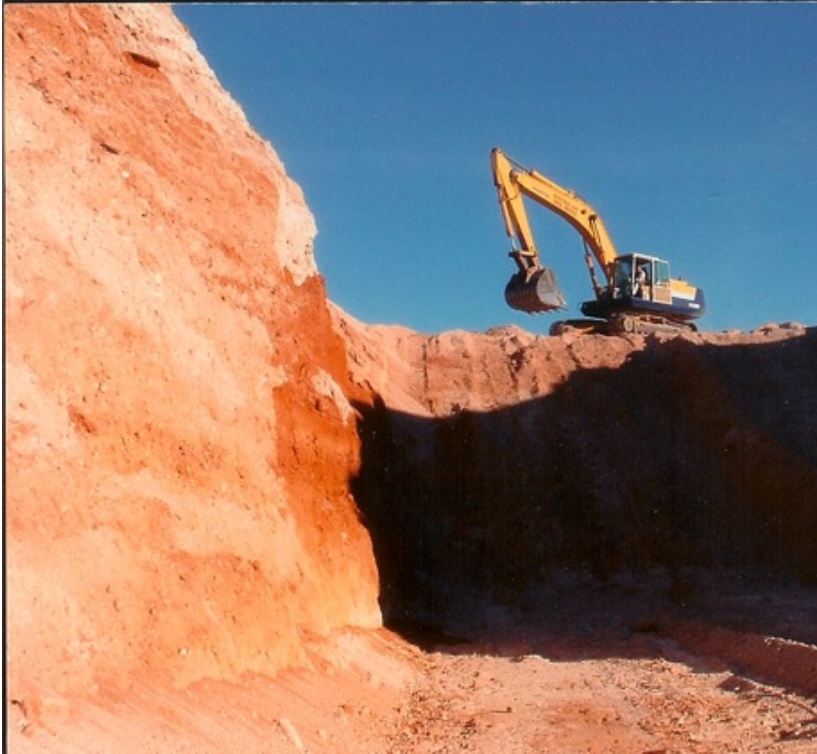
Australian Opal Mines Mining 8 Mile Field