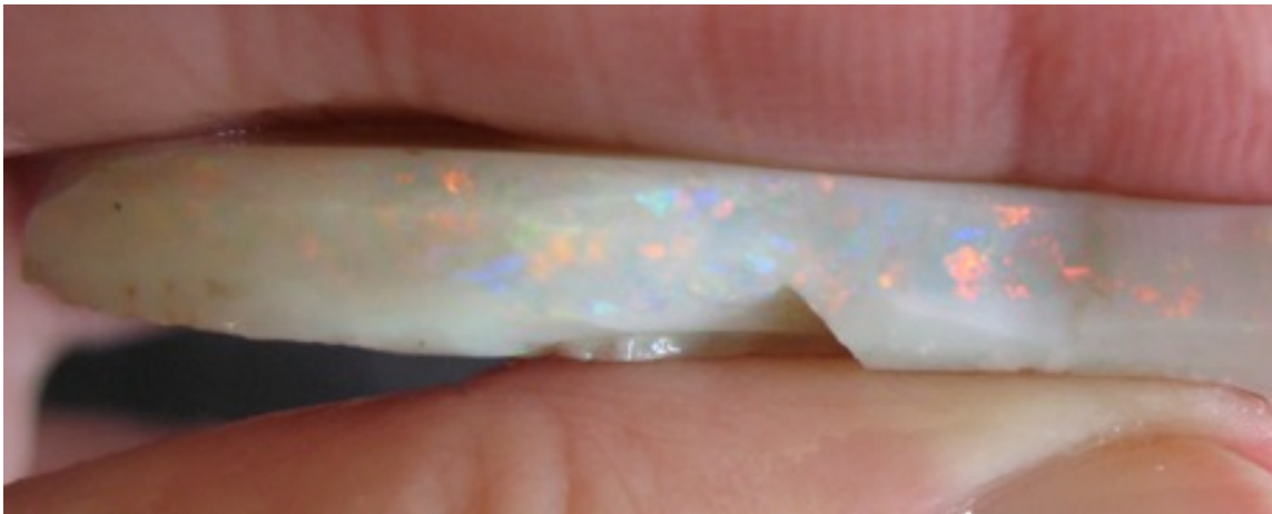
$1,940 IMG_5072 8 Mile $4,000/oz 59mm x 23mm x 7mm thick .485oz/15.08g