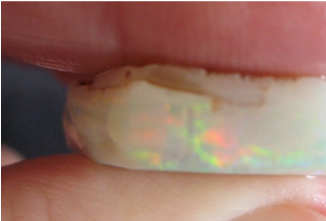
$1,940 IMG_5080 8 Mile $4,000/oz 59mm x 23mm x 7mm thick .485oz/15.08g