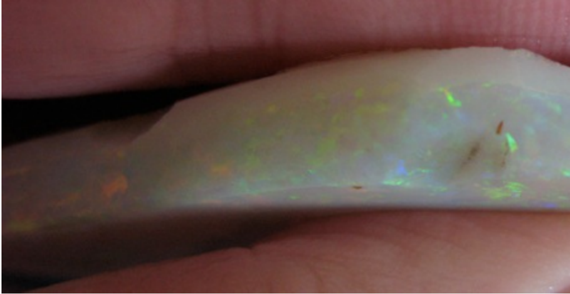
$1,940 IMG_5078 8 Mile $4,000/oz 59mm x 23mm x 7mm thick .485oz/15.08g