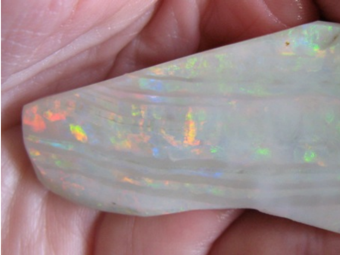
$2,940 IMG_5071 8 Mile $4,000/oz 59mm x 23mm x 7mm thick .485oz/15.08g